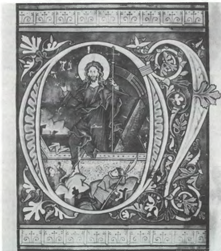
Initial M with the Resurrection, Mainz, ca. 1260.

“ ‘Don’t be alarmed,’ he said. ‘You are looking for Jesus the Nazarene, who was crucified. He has risen! He is not here!’ ” (Mark 16:6, NIV).