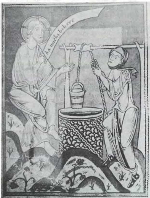
Jesus and the Samaritan woman. From the prayerbook of St. Hildegard, 1179.

“ ‘It is too small a thing for you to be my servant to restore the tribes of Jacob. . . . I will also make you a light for the Gentiles, that you may bring my salvation to the ends of the earth’ ” (Isaiah 49:6, NIV).