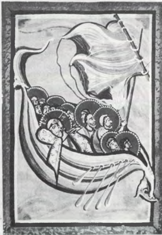
Christ on the Sea of Galilee. Cologne, early 11th century.

“And he arose, and rebuked the wind, and said unto the sea, Peace, be still” (Mark 4:39).