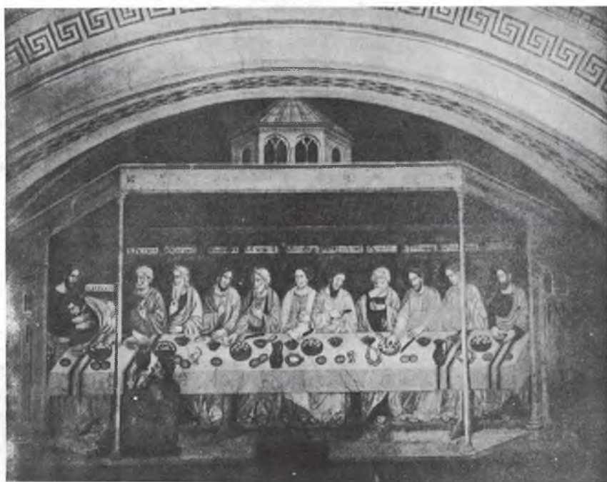
The Last Supper. Umbro-Sienese School, early 15th century.

“ ‘This is my blood of the covenant, which is poured out for many’ ” (Mark 14:24, NIV).