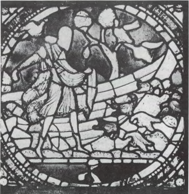
The Parable of the Sower. Stained glass from Canterbury Cathedral, late 12th century.

"He taught them many things by parables, and in his teaching said: 'Listen! A sower went out to sow his seed' " (Mark 4:2, 3, NIV).