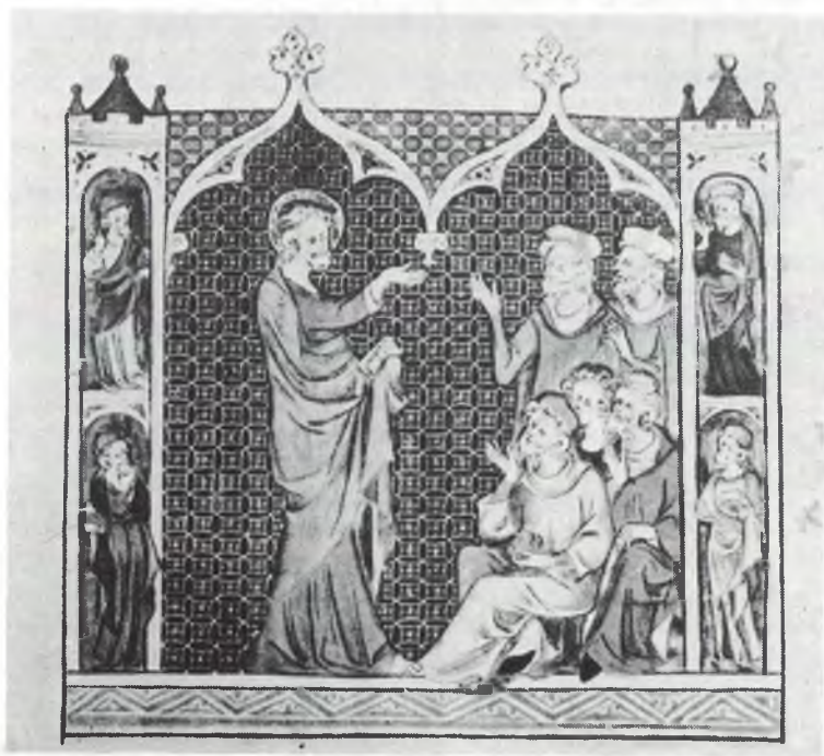
Christ Teaching in the Temple. From the Queen Mary Psalter, 14th century.

“ ‘For even the Son of Man did not come to be served, but to serve, and to give his life a ransom for many’ ” (Mark 10:45, NIV).