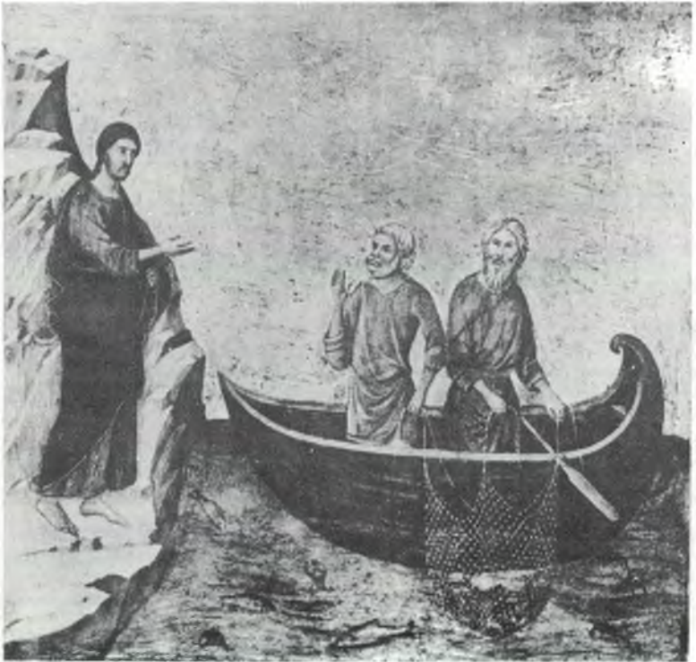
The Calling of the Apostles Peter and Andrew. Painting by Duccio di Buoninsegna.

“ ‘If anyone would come after me, he must deny himself and take up his cross and follow me’ ” (Mark 8:34, NIV).