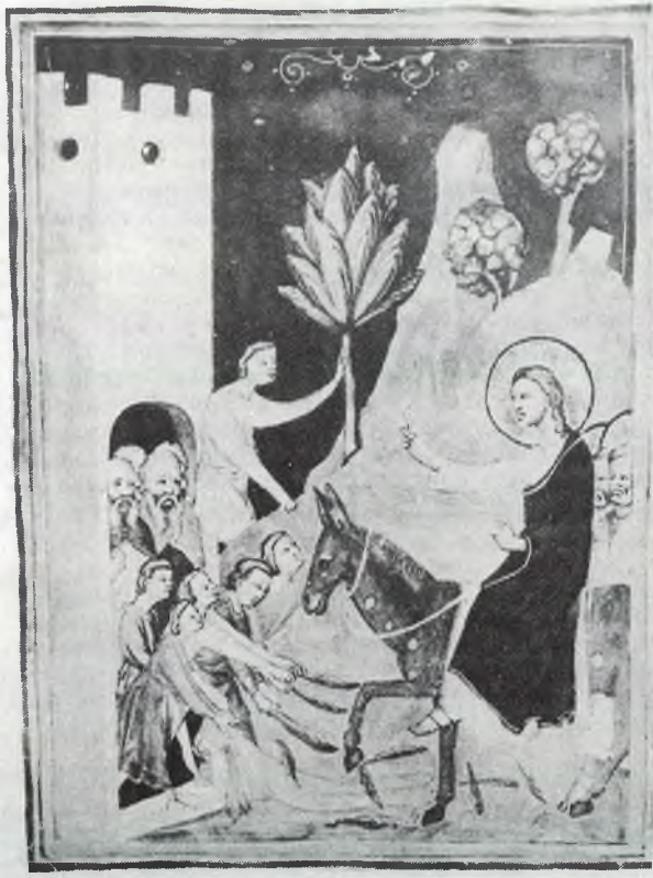
Christ's Entry into Jerusalem. Ca. 1400, Italy.

"Rejoice greatly, O Daughter of Zion! Shout, Daughter of Jerusalem! See, your king comes to you, righteous and having salvation, gentle and riding on a donkey, on a colt, the foal of a donkey' " (Zechariah 9:9, NIV).