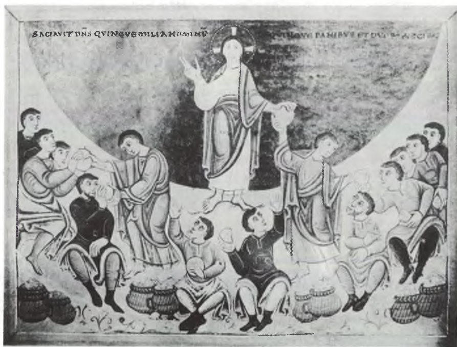
The Feeding of the 5,000. From the Gospel Book of 1194, Germany.

“ ‘I am the bread of life. He who comes to me will never go hungry, and he who believes in me will never be thirsty’ ” (John 6:35, NIV).