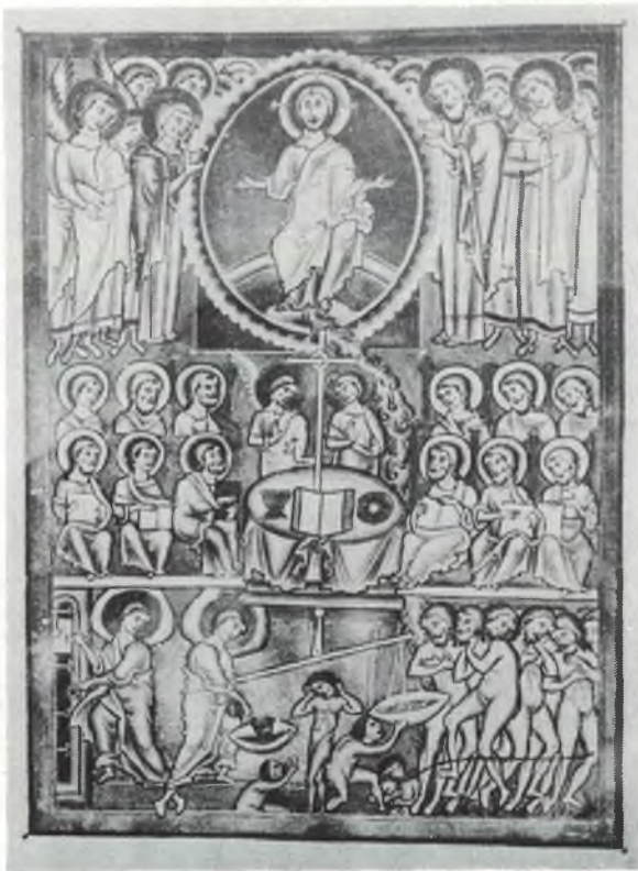
The Last Judgment. From the Gospel Book of 1194, Germany.

“ ‘At that time men will see the Son of Man coming in clouds with great power and glory’ ” (Mark 13:26, NIV).