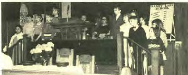
Shown are the younger students as they sang about their school.