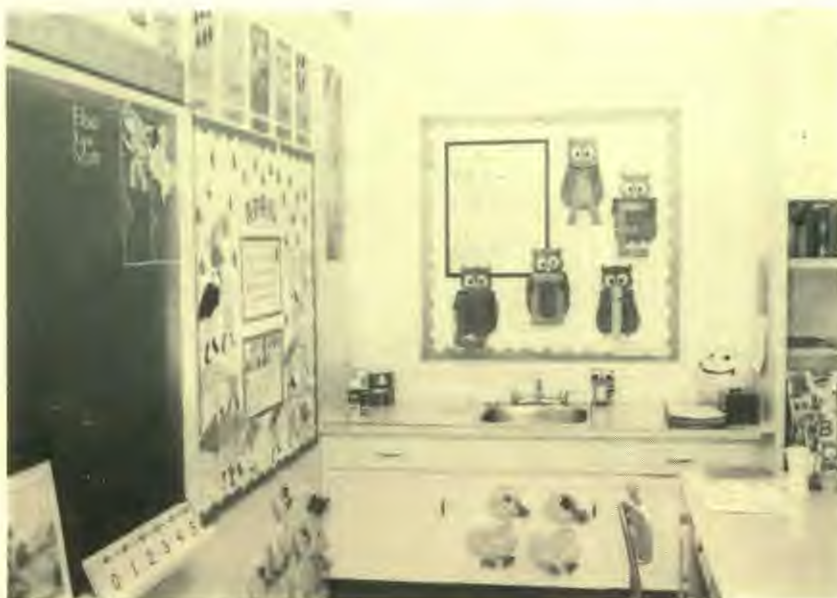
One of the classrooms decorated for Open House.