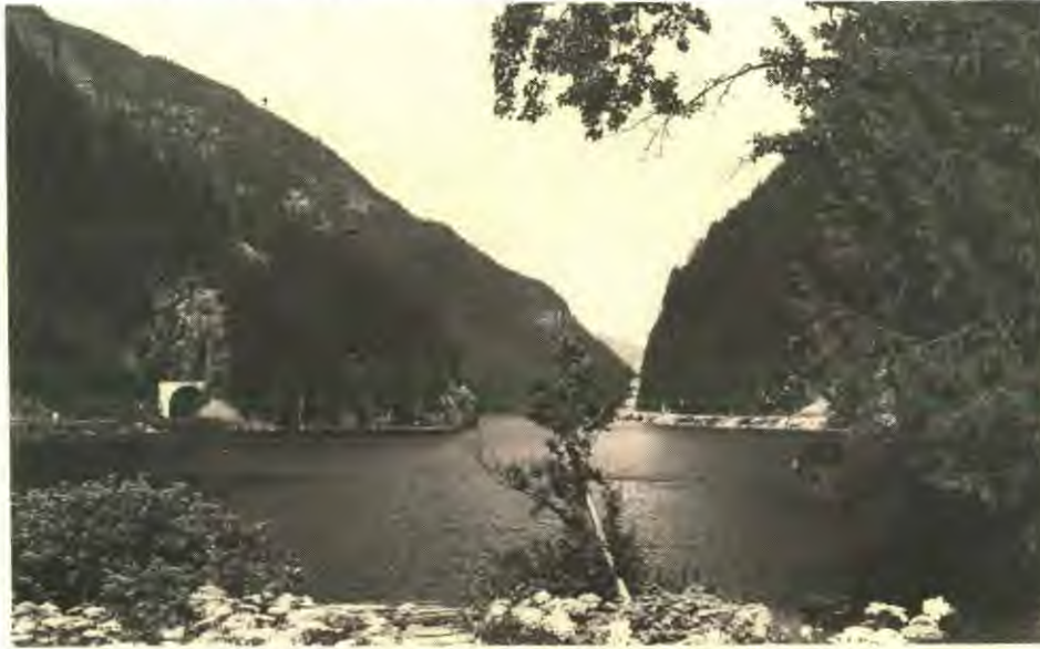
"Where the Bible and Nature Meet"