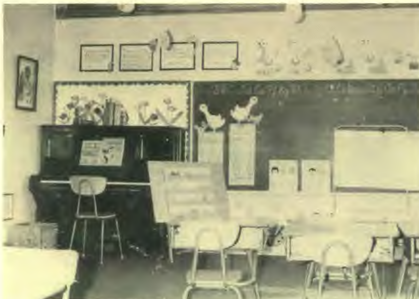
Another of the decorated rooms.

Tiger and elephant heads, ostrich-sized easter eggs, and a marshy bog were among the displays seen by over 150 visitors at the Okanagan Academy Open House on April 9.