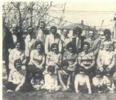
Italian Group, April 30, 1977.

What a change for my wife and myself, this jump across the Atlantic! It is not so easy when one is more than fifty years old, to start a new life in a different country with different methods, new people, new customs, and a new system of life. Truly it is a trying proof of our character.