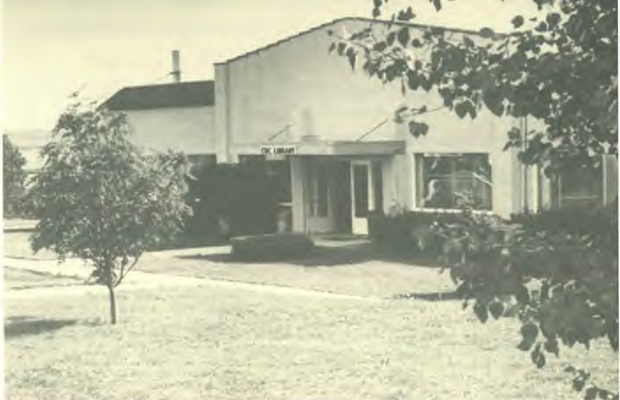
Entrance to the Library building.