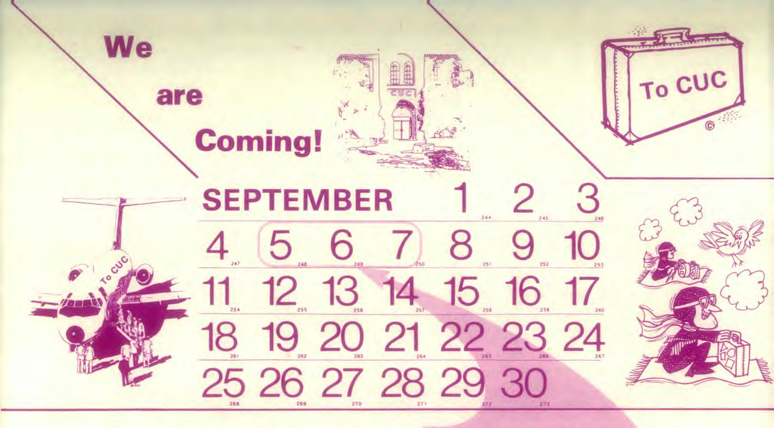
Sept. 5 — Freshman Orientation — College Sept. 6 — Registration High School & College