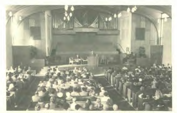
Sabbath morning church service at C.U.C.

A critical need at present is that of a College Chaplain to adequately coordinate the spiritual activities of the youth with that of the church and community. This would fully integrate the College, the church and the community in a vital force which would result in decisions for Christ, baptisms, and fellowship in the remnant church.