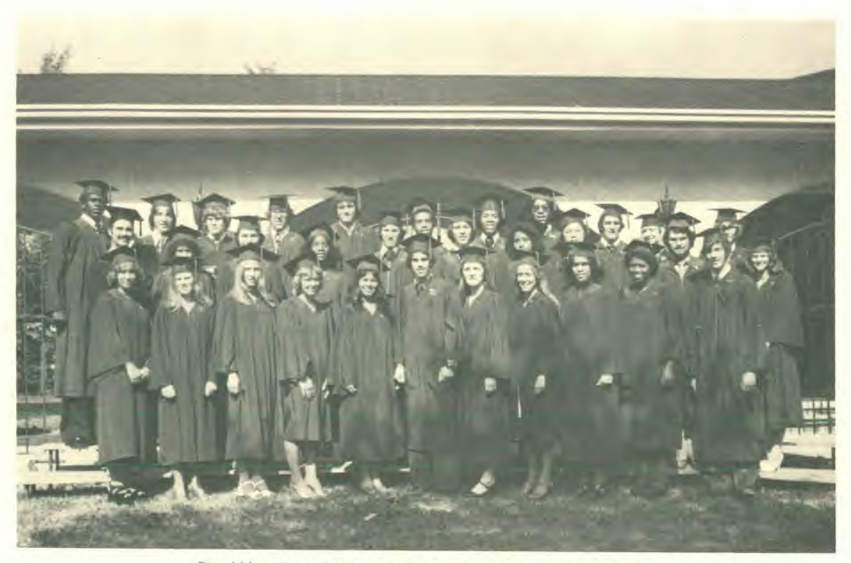
Royal blue caps and gowns plus happy faces make a beautiful picture.

Grade 13 Class pose happily after Commencement.