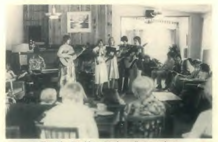
Through Sunshine Bands college students brighten a Sabbath afternoon for residents of the Senior Citizens Lodge.

The Canadian Union College Ministerial and Theology departments work closely with the pastoral staff of Lacombe SDA Church. Theology students receive a mini-internship in many areas of their chosen profession by teaching in the Sabbath School departments of the church at College Heights, and occasionally preaching not only in the church at College Heights but in assigned churches within driving distance.