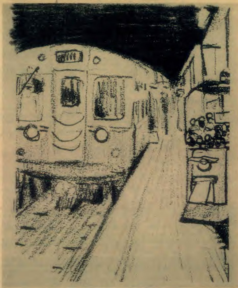
Sketch from The Majellan.

When the lad's account petered out the priest enquired about the Adventist programme for youth. He was amazed to learn that on Saturdays when most of Sydney's teenagers are on the beach, the Adventists have a detailed programme of religious formation. The boy explained what he was doing and what he was working towards in his religious education.