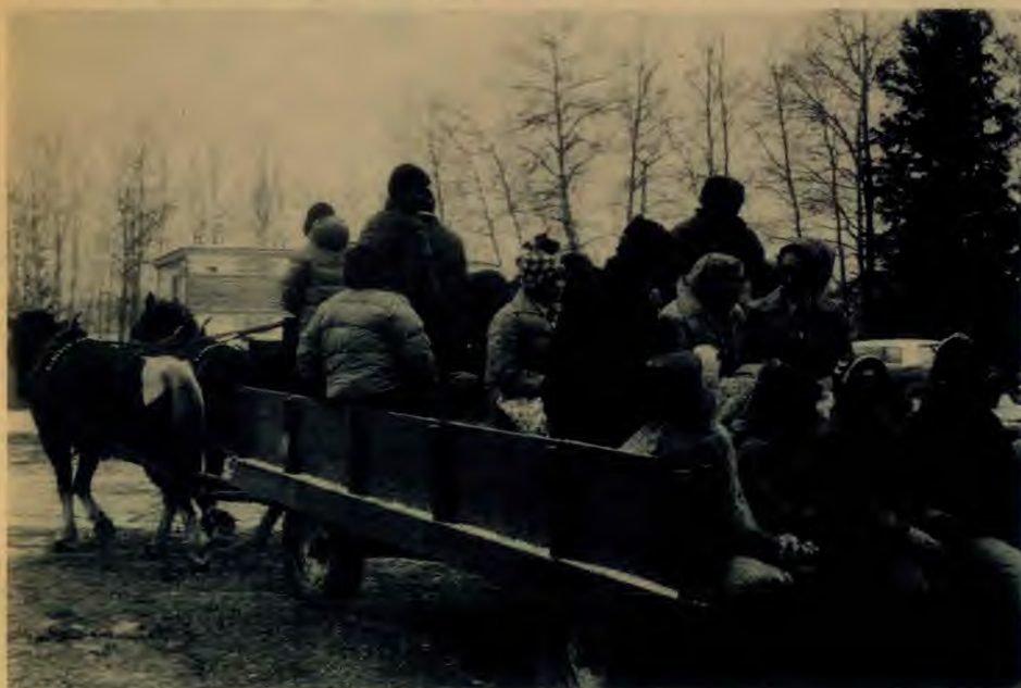
Hayride - Family Camp.