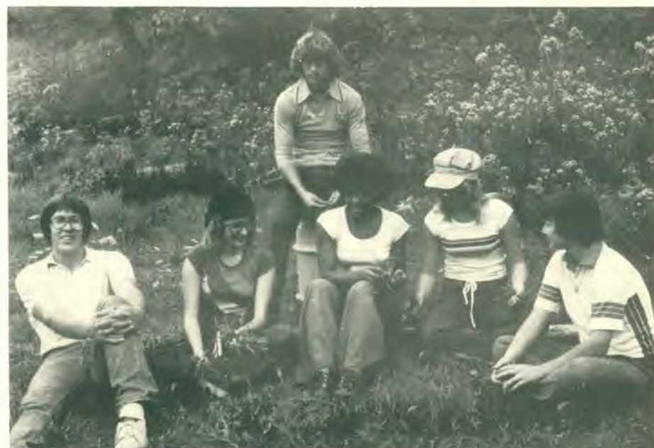
Students go on Sabbath afternoon hike.