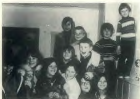
Students in the Grades 5-8 room at the Bay Roberts school.