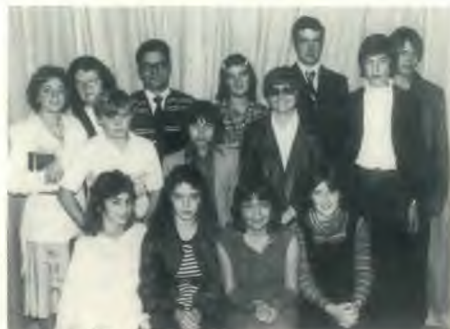
Pictured are those baptized on October 1 at Williams Lake. Three are missing from the picture.

The entire series of meetings were held in our local church and the attendance was most encouraging. About 60 visitors attended the meetings. The average attendance ranged from 150-300. Of the 60 visitors about 40 were quite regular. The Lord richly blessed us here in Williams Lake. The entire church family experienced a real revival, and, furthermore, the Lord blessed us with 21 new members. On September 17, four were baptized and October 1, seventeen more took their stand in baptism. Fourteen others are preparing for a future baptism.