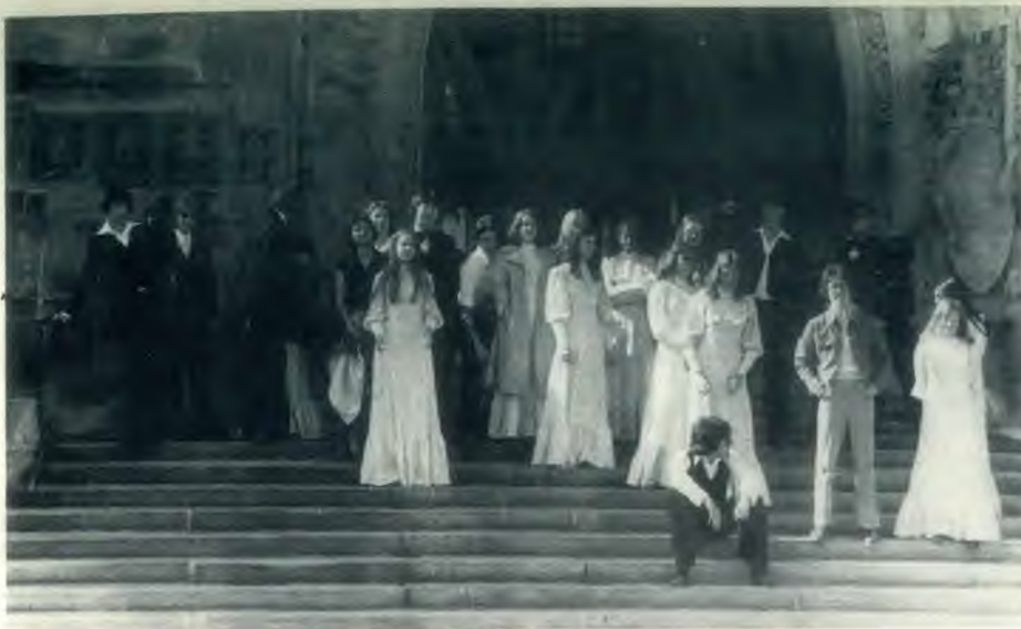
Members of K.C.'s Concert Band witnessing in the nation's capital.