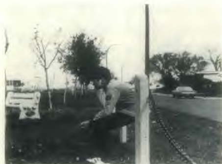
Sample of the photographic printing and developing done by students at Lethbridge.