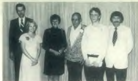
Newly baptized members with pastors after baptism on September 17.