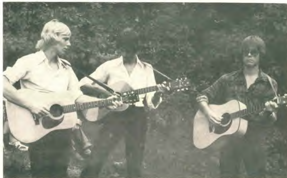
Singing choruses in the valley is much a part of life at Kingsway.