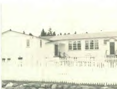
Bayview Junior Academy, Lethbridge, Newfoundland.