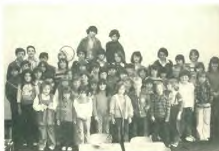
Lethbridge, Newfoundland, students.

social studies and the slides served as a visual review of their lessons.