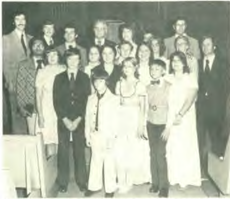
At the church service, on October 22 eighteen precious souls were baptized.

In answer to many prayers the Holy Spirit has been at work in Oshawa, Ontario. Fifty-two persons have been baptized and many others have re-dedicated their lives to Christ.