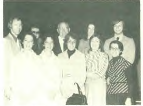
Those baptized on evening of October 29.