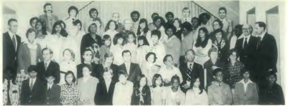
Some of the precious souls that were baptized during the crusade.