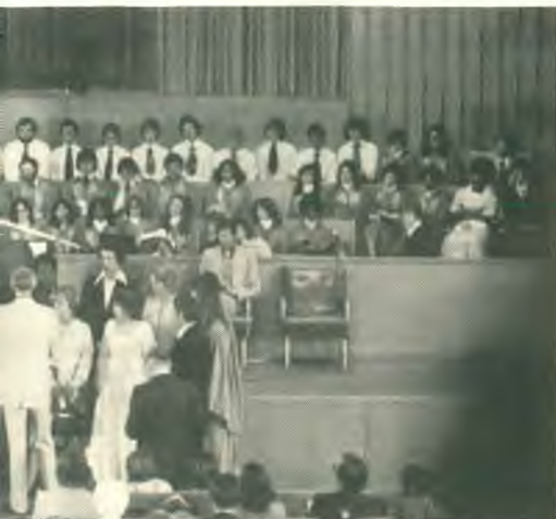
etings are these many baptismal candidates. The occasion.

ry involved in religious activities: "They blend n't be duplicated anywhere. We have a fantastic enge to do my small part to harness our student