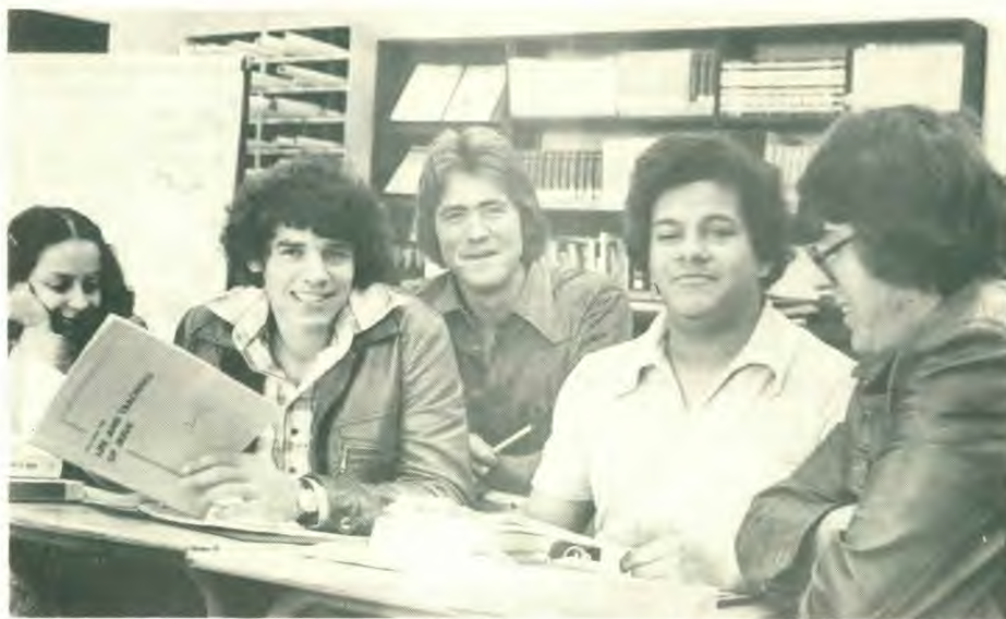
Students of Grade 13 doing research for their course "Life and Teachings of Jesus".