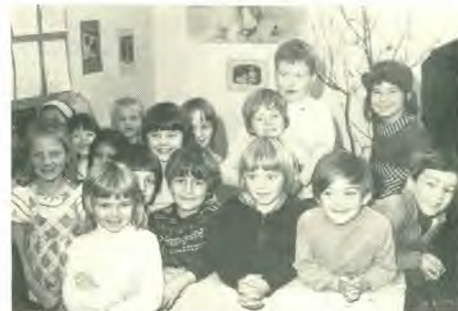
Happy grade 1 and 2 students.