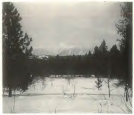
Site of proposed school-church structure, Cranbrook, B.C.

A sizzle in the hot springs or a bath in the snow may be your introduction to the small group of active believers that work in the busy cities of the southeastern Rockies. Cranbrook, Kimberly and Fernie boast a market population of 58,000 but this same area has not yet a church.