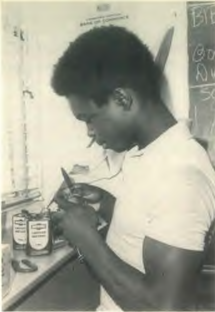
Electronics wizard at work? — Winnipeg.