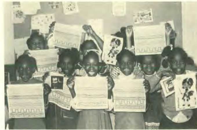
Students display practical arts projects.