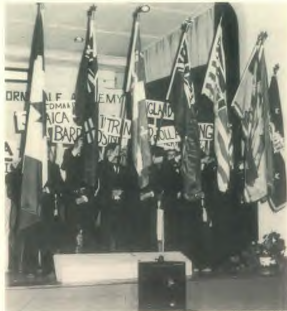
Flags of the provinces and banners and costumes of countries represented made a colorful display.