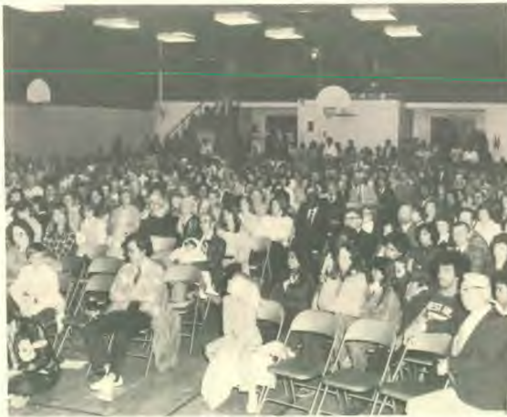
An interested audience packed the auditorium for the historical program and pageant.