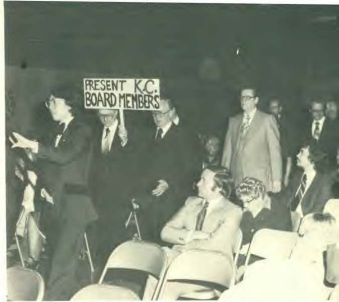
Some of the members of the present Kingsway College Board.