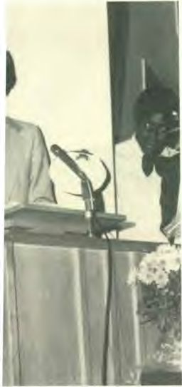
s of 1925 was Year by Alumni