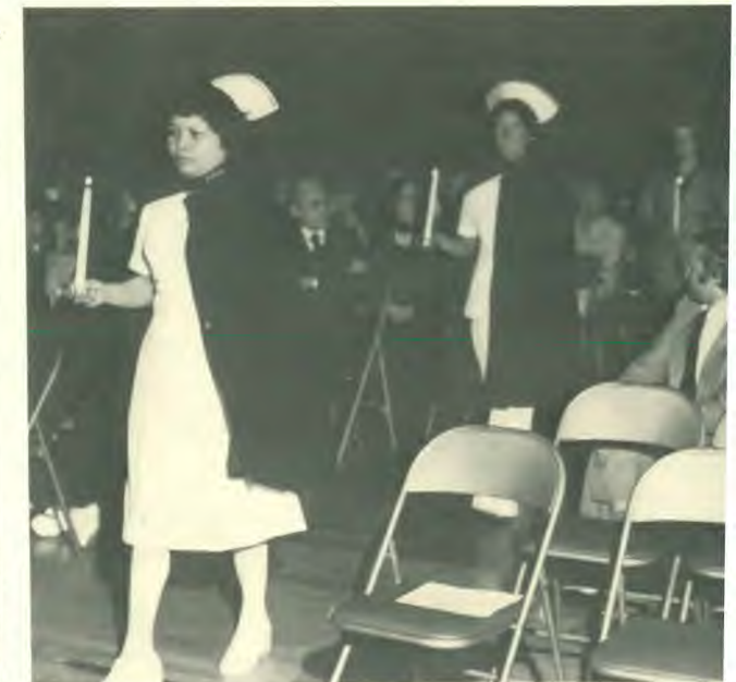
Nursing students of Branson Hospital and Kingsway College