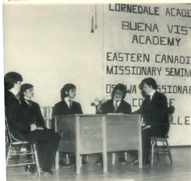
The "conference committee" decides to operate a school in Ontario, opening in 1903.