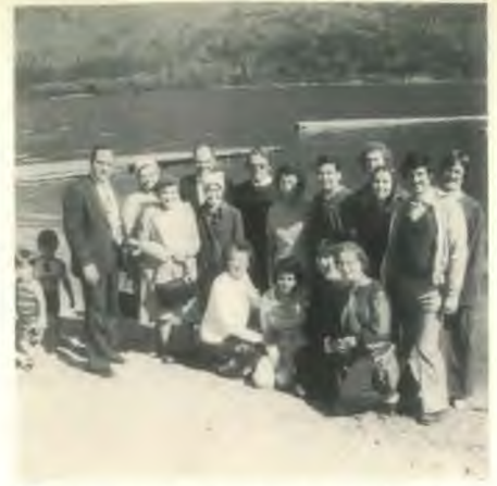
A happy group of baptismal candidates in the Chilliwack Crusade.

Preparation work for the series included visitation by the literature evangelists of British Columbia, as well as a