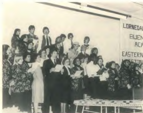
"I'm from O.M.C." sang the choir remembering the school song of former days.