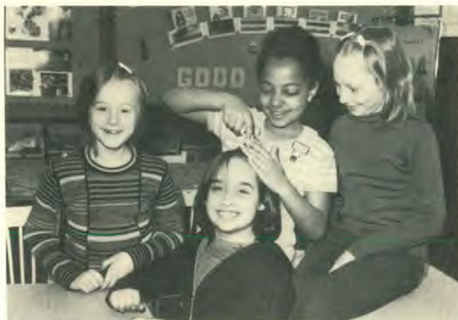
Extracurricular projects - Winnipeg classroom.