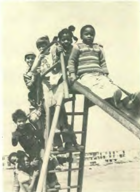
Noontime is fun time as Montreal students play together.