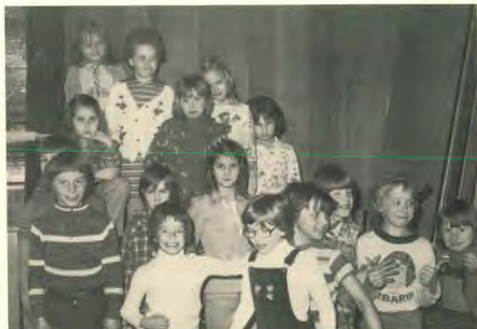
Grades 1-3 students at play, Saskatoon.