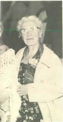
ornedale Academy. Miss class of 1914) and Mrs. specially honored.