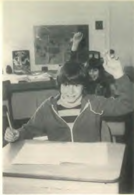
Students have the answers at Yorkton.