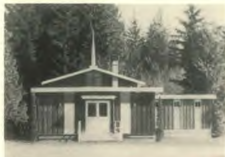
Powell River church, showing the new addition at the right rear.

The Powell River company has recently completed a sizable addition to their church building. This addition consists of a large multi-purpose room with an adjoining kitchen. There has also been provision made for additional washroom facilities at a future date.