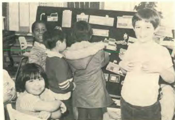
Happy noon-hour faces at Winnipeg.