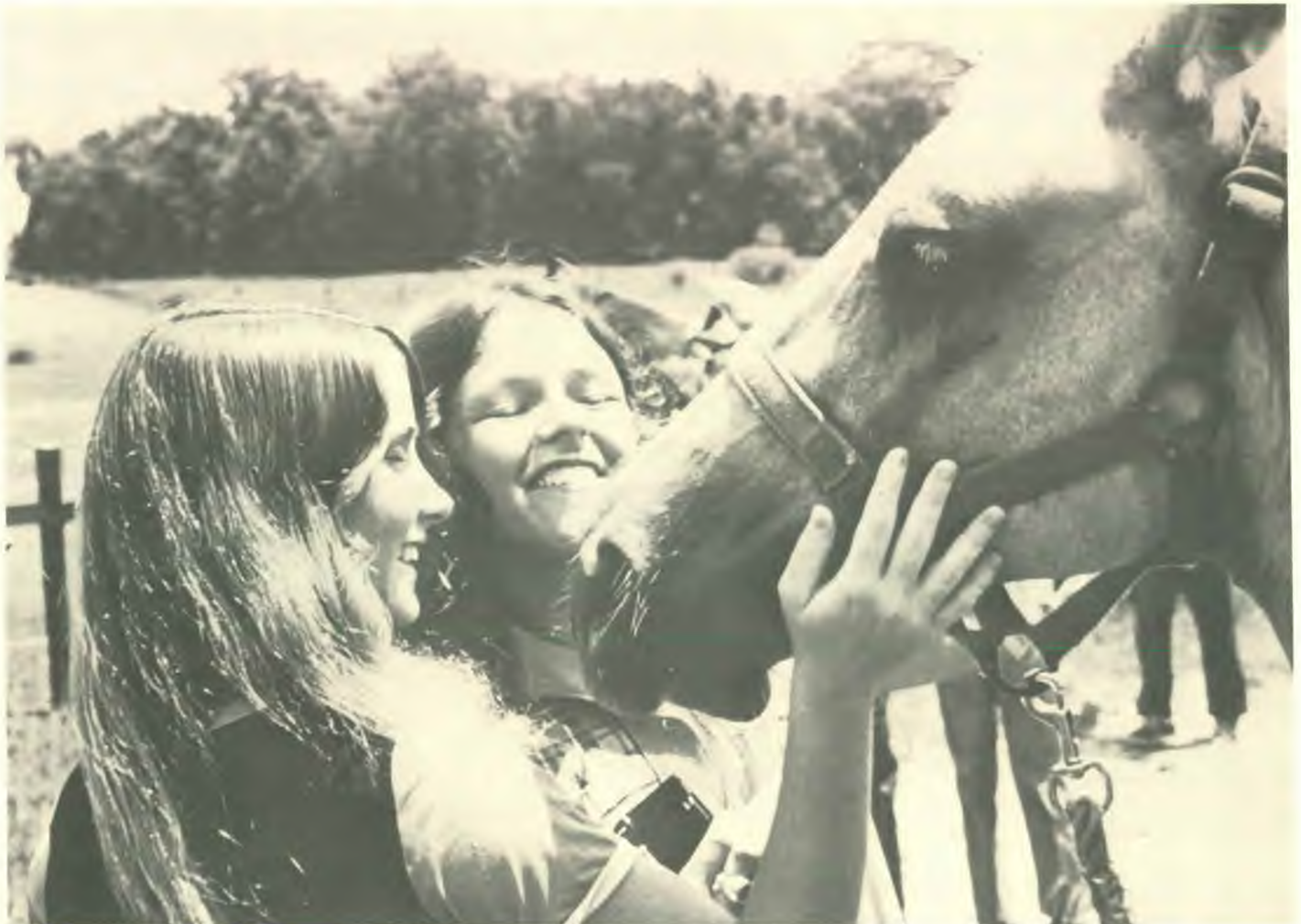
Blind campers caressing horse's face.

The Christian Record Braille Foundation, Inc. 4444 So. 52nd St., Lincoln, Nebraska 68506