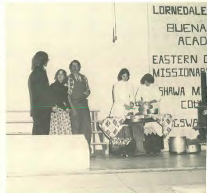
The kitchen at Lornedale Academy, 1912.