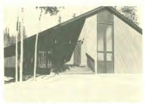
Sabbath morning, July 1, the church was ready for Sabbath School and worship.