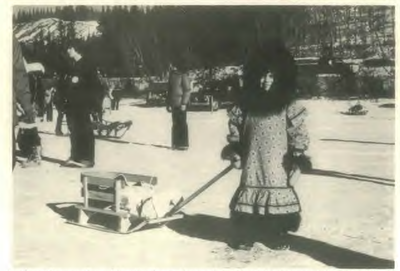
As the call came from Macedonia, so those of the Northland cry out for help. What is your answer?

Won't you come up north and help us? See centre spread for latest news.