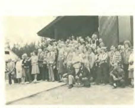
Maranatha Flights International group.