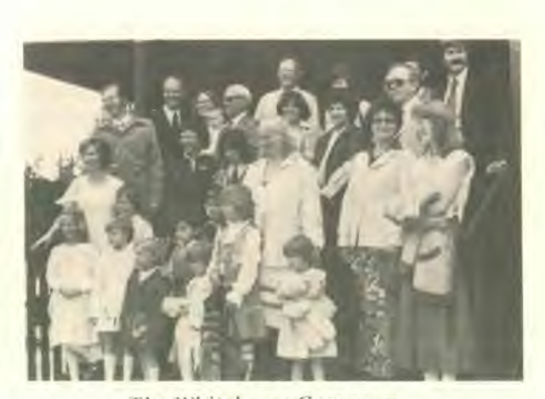
The Whitehorse Company.