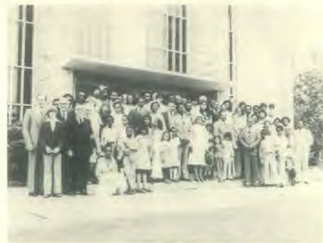
Pictured here is the Literature Evangelist team of Ontario which led the world field in deliveries for 1977 and from all indications, will do likewise in 1978.