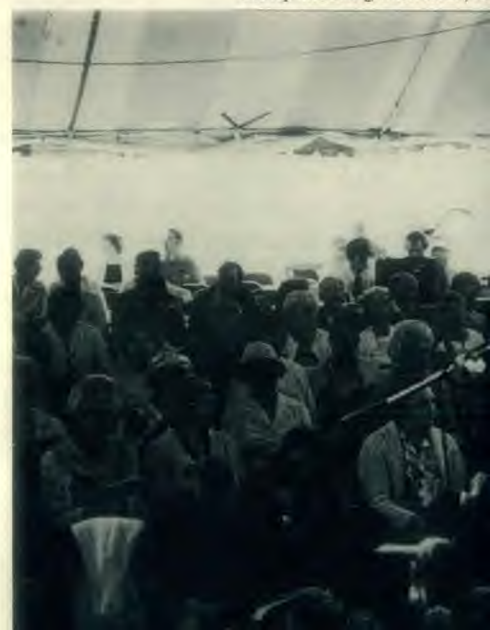
Camp meeting chorister, D