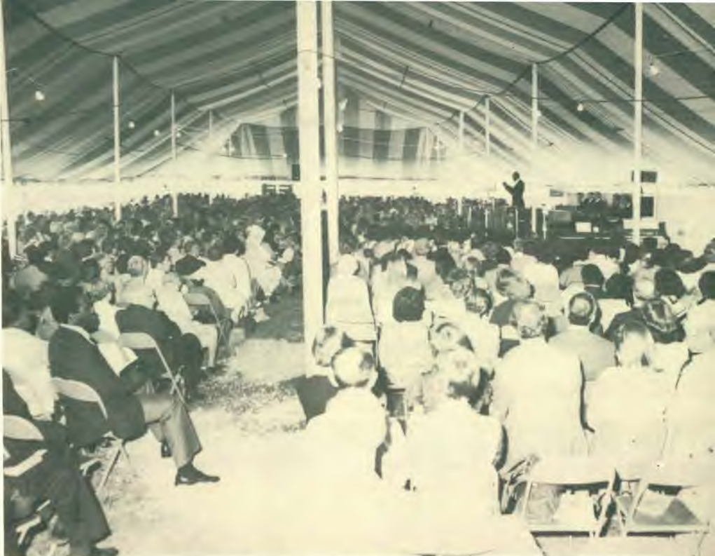
Church members from throughout Ontario packed the main tent every Sabbath.