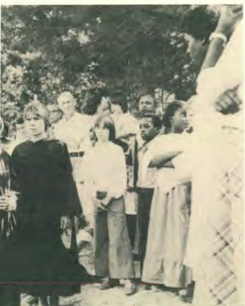
of camp meeting.