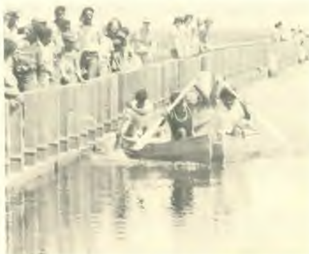
Camporee canoe races thrilled everyone.

Over 350 Pathfinders and staff representing 14 clubs converged on Sturgeon Woods Camp Grounds near Pelee Provincial Park for the annual Ontario Pathfinder Camporee on June 2-4.