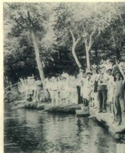
Baptisms were a b