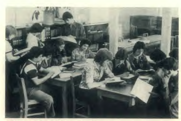
We STUDY together ...