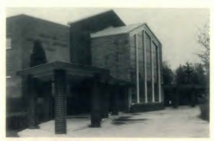
We WORSHIP together ...