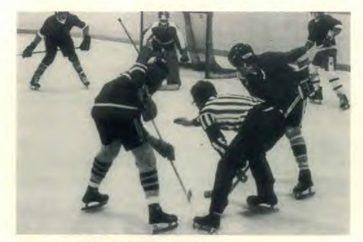
But we PLAY, too!