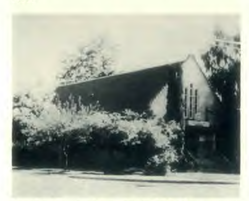
As of July 1, the Grand Forks Company is conducting services in the St. John's United Church in Grand Forks. Formerly they met where there was no organ or piano to accompany the singing.