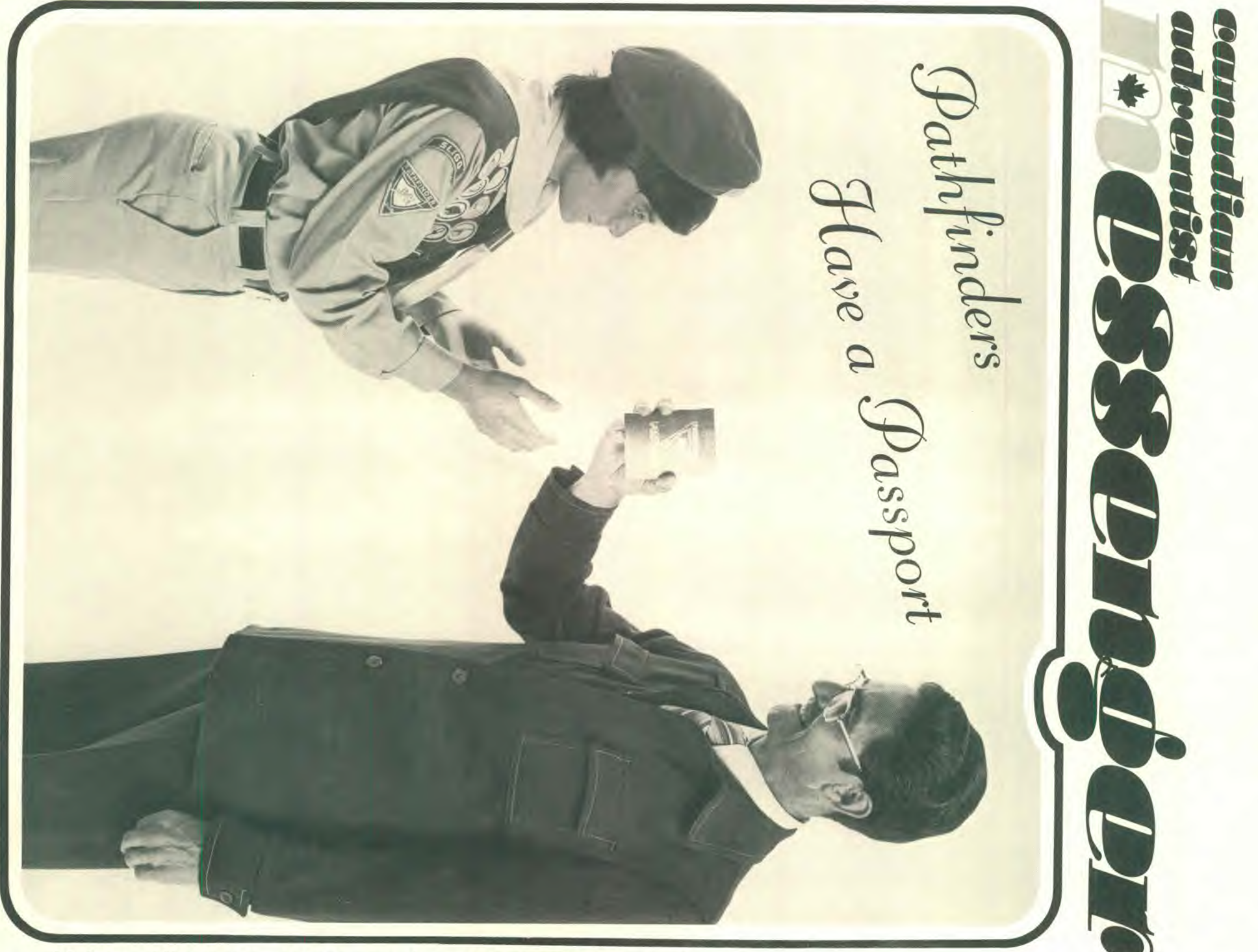
Volume XLVII, No. 17, September 7, 1978 Oshawa, Ontario