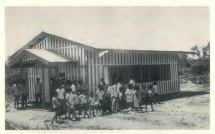
Jungle chapels in the Far East are built to a simple design, so that available funds can be spread over a wider area.

If all these chosen special projects were to be fully funded, Sabbath School members around the world would need to double their usual 13th Sabbath offering on December 23, 1978. The people of the Far East thank you in anticipation of receiving an overflowing 13th Sabbath offering this Christmas.