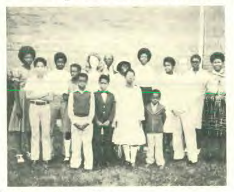
Those baptized in both baptisms in the crusade.

A recent nine-day summer-reapingcrusade in downtown Toronto with Elder W. W. Fordham from the Regional Department of the General Conference resulted in a total of twenty-nine baptisms.