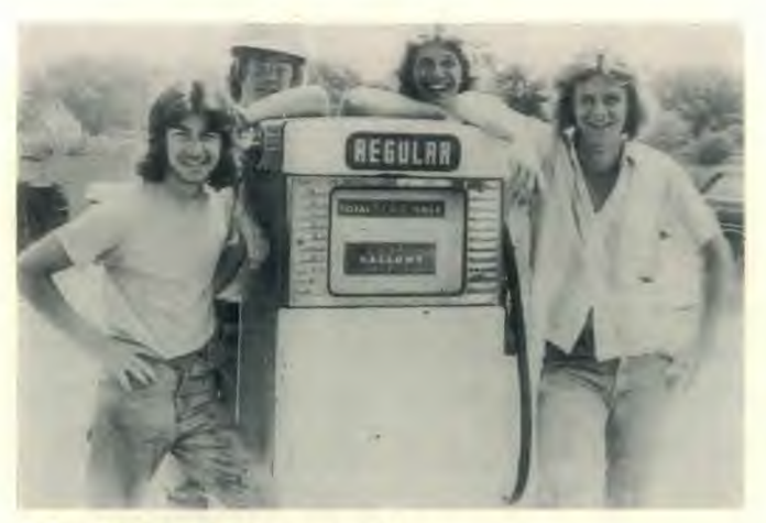
We WORK together ...