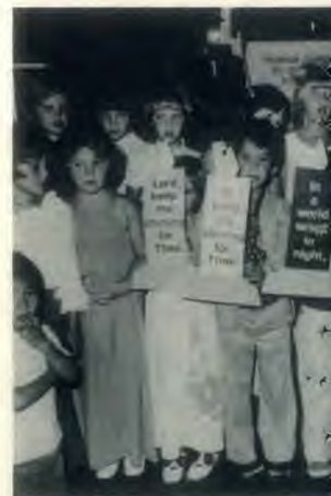
Singing new songs about