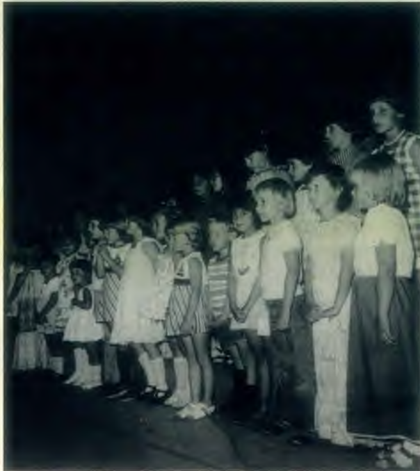
Primary graduation — Rutland, B.C.