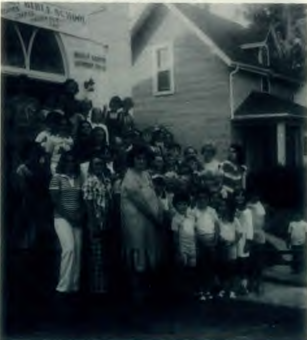
Teachers and students — Chatham, Ontario.

The Church in the Wildwood in East Kelowna was filled to capacity with children, parents, friends and helpers on the evening of July 13, as the children presented the closing programs of Vacation Bible School.