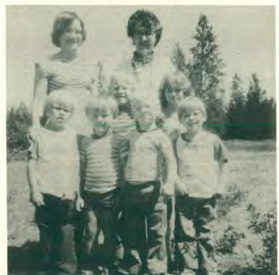
Happy Kindergarten — Kelowna, B.C.