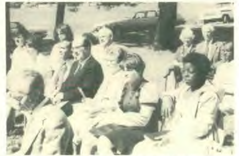
Some of the friends and members attending the organization of the Owen Sound church.