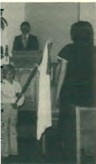
Christian flags —

Chatham S.D.A. church enjoyed another successful V.B.S. program this year. Our attendance this year, as in past years was approximately 50 children and we are happy to report that we never had an advertisement campaign. The children love to come back year after year and bring their friends.