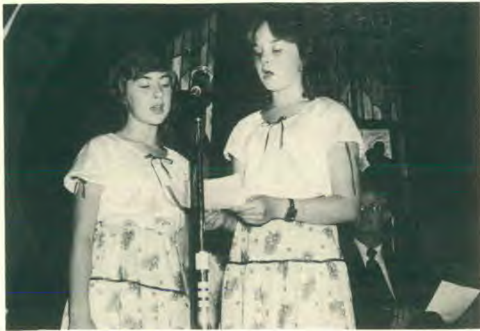
Camp meeting and music — inseparable.