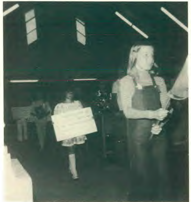
"Christian Soldiers" march to graduation — Rutland, B.C.

The program impressed those in attendance as the children's voices sang praise to the Lord and testified of their new-found knowledge. Let it be our prayer that these children will hold these truths close to their hearts and be ready to meet our Lord.