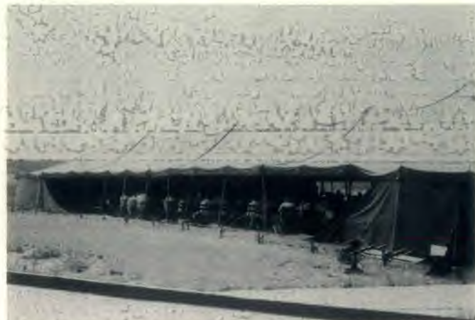
The tent where the main services were held, has become too small and will have to be enlarged next year.