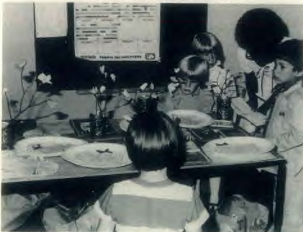
Learning new crafts