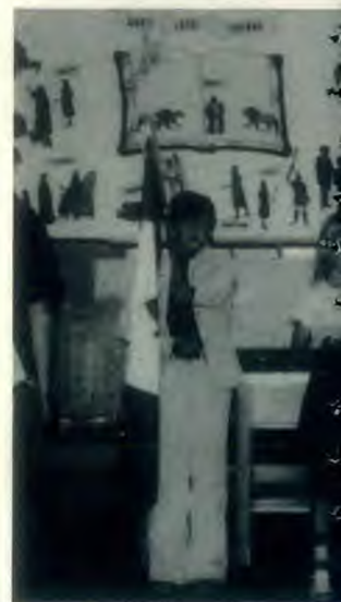
Saluting the Canadian Tantallon, N.S.