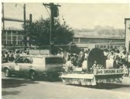
Youth Smoking Alert float which placed first, for the Nova Scotia region, in the Junior Commercial section of the Halifax parade.

world the type of youth our Christian education has produced.