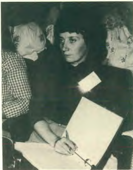
Rapt attention was given to the many noteworthy presentations.