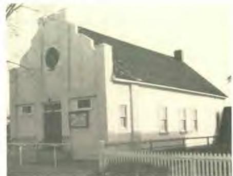
Old Calgary Bridgeland Church — used for 50 years.

The last few years saw an increasing need to erect a new church building, and so work was begun in earnest. The membership at that time was barely approaching 30 — a noble task indeed for so few. After several attempts to secure the necessary permission to build, the required permits were finally issued by the city. The vigorous assistance by a local alderman deserves worthy mention in helping us to obtain the Development Permit. Demolition of the old building and con-