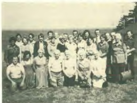
Group at Sabbath School Workshop, Camp MeVa, Maritime Conference.