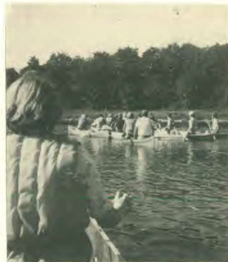
Maritime Youth "Running the Miramichi".