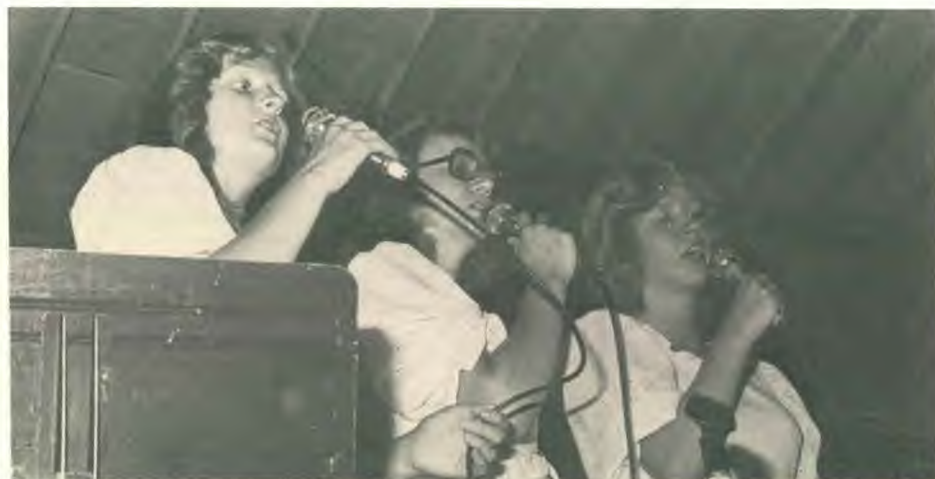
Thirty minutes of inspiration through music was a much enjoyed feature from 7:00 to 7:30 p.m. as part of each evening meeting.