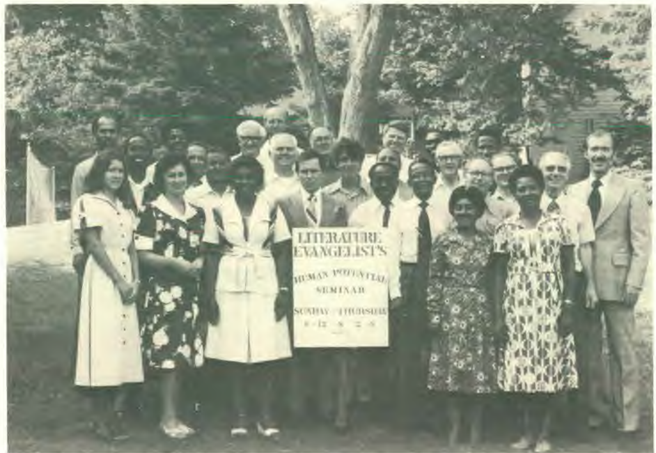
Pictured above is part of the Literature Evangelist team from Ontario who were in attendance at the Human Potential Seminar.