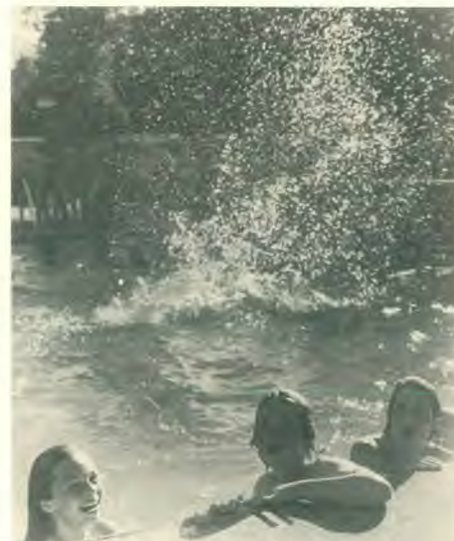
On warm days youth enjoyed the refreshing water of Camp Hope's outdoor swimming pool.