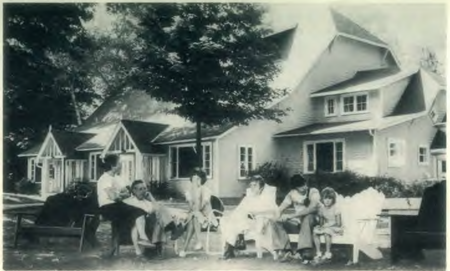
Relaxing in front of the chapel are some of the several hundred who spent their Labor Day weekend at Keswick.