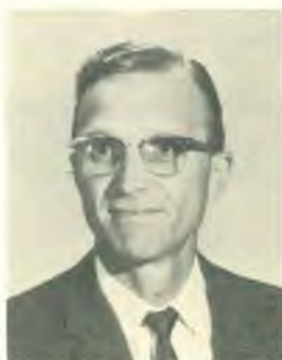
G. E. Andersen Maritimes