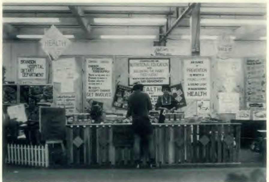
Branson Hospital's Dietary Department's booth at the Canadian National Exhibition. The C.N.E. Committee requested this service to the public and the booth and all services were given free of charge.