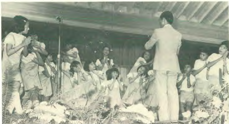
The Taiwan Children's Choir received a standing ovation as Adventist believers broke tradition and stood clapping in an effervescent attempt to show their spiritual love and appreciation for their young brothers and sisters who live across the sea.