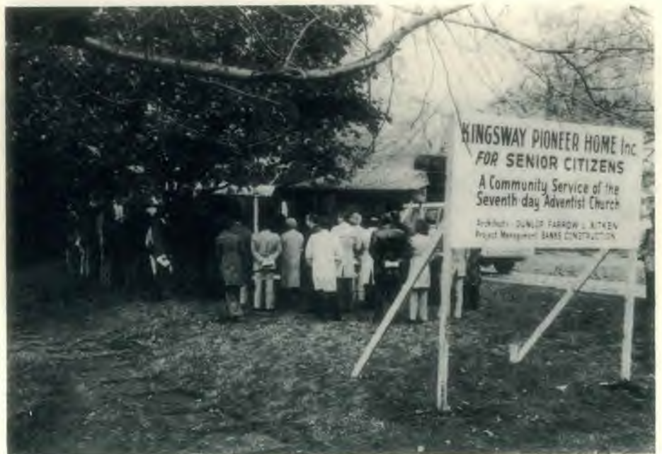
Part of the audience that braved the elements to attend the cornerstone laying of the Kingsway Pioneer Home for Senior Citizens in Oshawa.