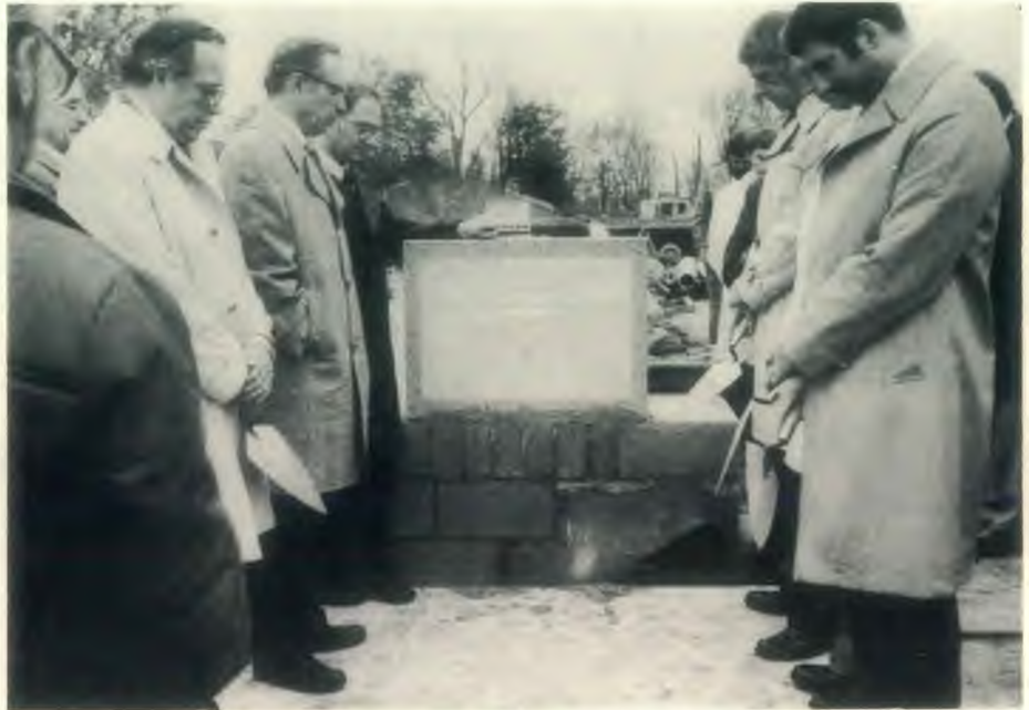
Guests, officials, and dignitaries pause for prayer after the cornerstone laying.