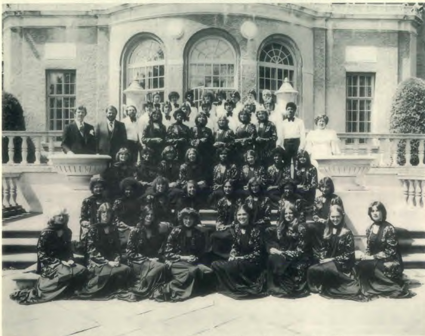
The Kingsway College Symphonic Choir at the Parkwood Estate, Oshawa, June, 1978.