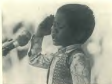
A point of emphasis in the sermon of a child preacher.