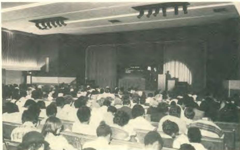
The crowd that filled the Westview Centennial School Auditorium in Downsview on the last night of the It Is Written Prophecy Crusade.