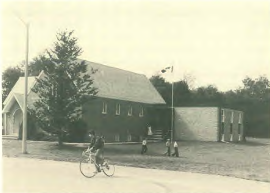
Niagara Falls church and Niagara Seventh-day Adventist Elementary School.