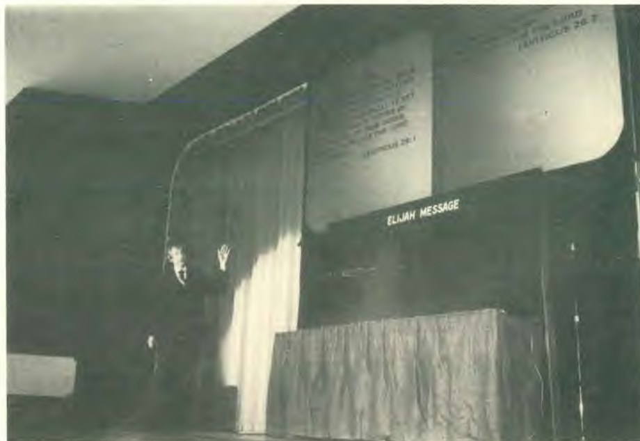
Pastor Lyle Pollett presenting the topic of the last evening of the It Is Written Prophecy crusade in Downsview.

On January 27, the It Is Written Prophecy Crusade moves to Oakville to conduct a four-week campaign. Please pray for the success of these meetings.