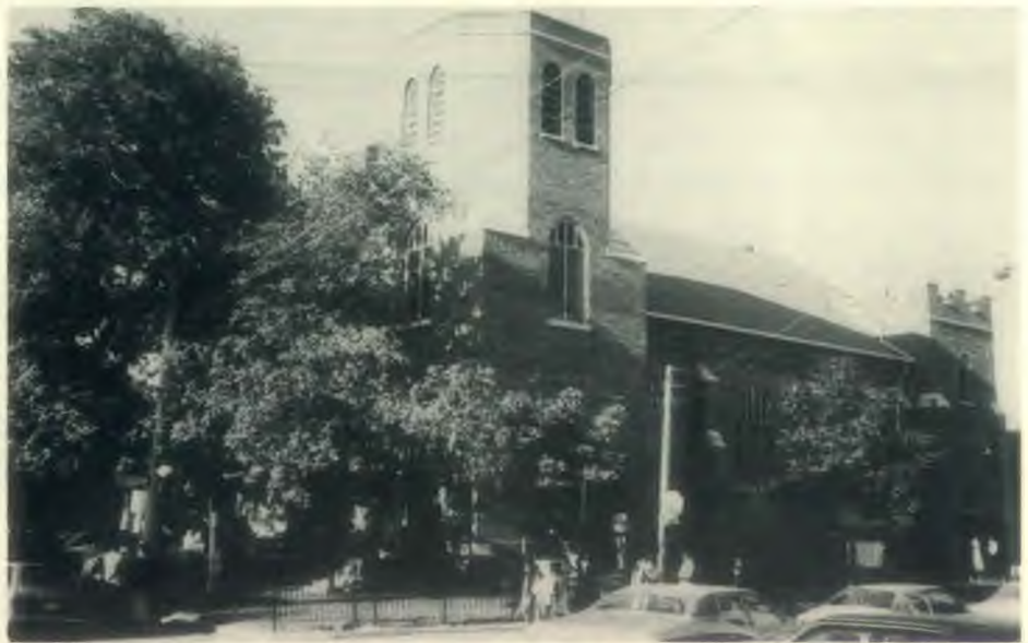
The Toronto Perth Avenue Seventh-day Adventist Church was dedicated on September 23, 1978. The church now has a membership of over 500.

He listed them as Repentance, Revival, Reformation, Refreshing and the Return