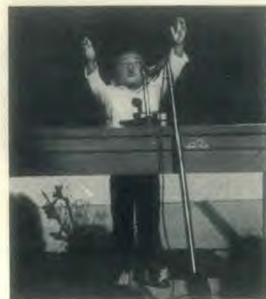
A child preacher pleading with all his congregation to give their hearts to Jesus.