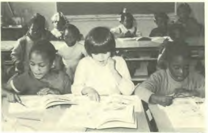
Reading in French.