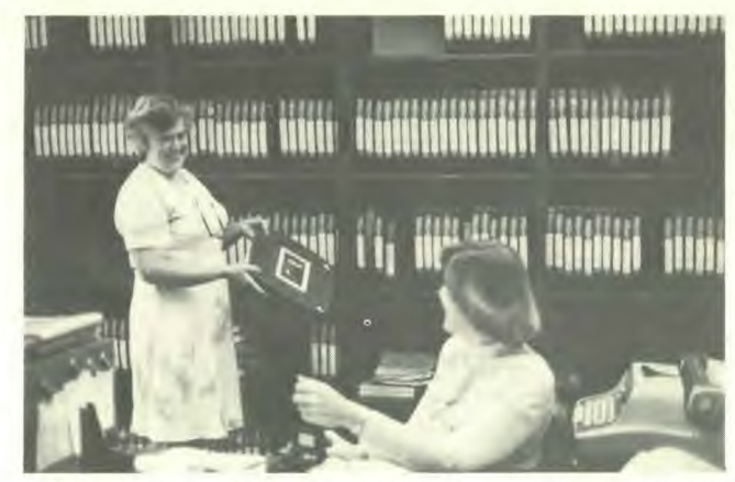
AAVM's film rental library numbers 405 selections, from short 15-minute films to full-length feature movies. Every film has been previewed and approved by a selection committee as appropriate for Christian audiences.

By Fire and By Sword takes you back through history to the time of the Waldenses. It shows the risks they took to distribute the Scriptures. Then this film concludes with the modern counterpart of the Waldenses—the Adventist colporteurs, some of whom face great perils in their literature ministry.