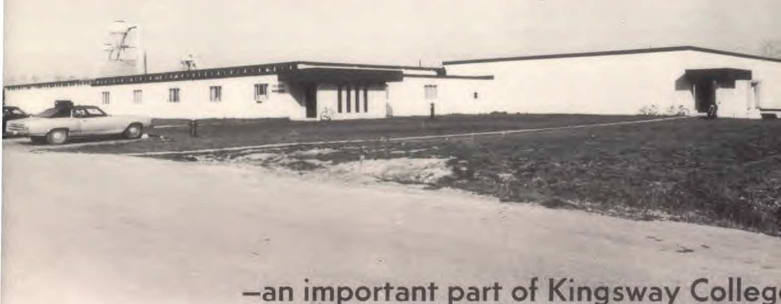
College Woodwork is housed in a large, modern building. The new addition is shown on the right.

Kingsway College is more than just books, classrooms, teachers, and studying. It is also a place to work. On campus we have several industries which employ the students on a part-time and summer basis, helping them to meet the cost required for their education and living expenses. These industries not only aid students to earn their school fees but provide them with training and give them experience for the many working years ahead.