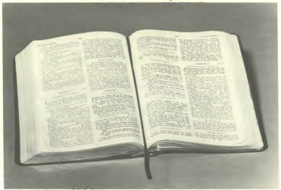
Have you sent in your card and donation for the IIW Heritage Bible? If not, do it today. You will be glad when you get your Bible. For further information write: It Is Written , Box 2010, Oshawa, Ontario L1H 7V4.