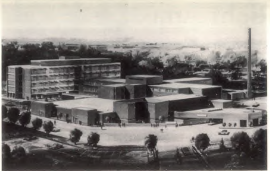
Artist's concept of the completed additions and renovations of the North York Branson Hospital.

And who better, as administrator of this brand new 70-bed institution, than the former administrator of our Rest Haven General Hospital, Sidney, British Columbia. Professionally equipped, and with experience and expertise in this