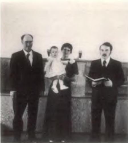
ESTEVAN BABY DEDICATION