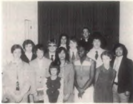
Pictured with their leaders is this happy group of Sabbath School members who were promoted to different divisions on December 23.