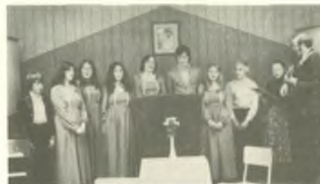
The "Jubilation Singers" provided music for the organization service and sing regularly for church gatherings.