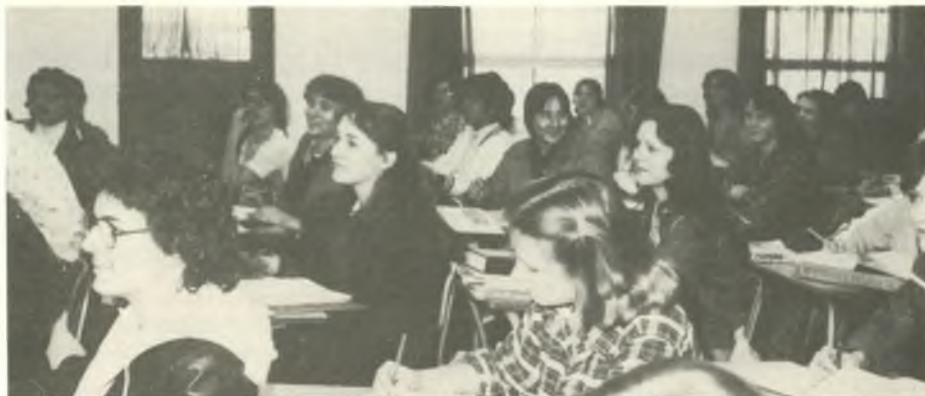
C.U.C. Academy students at work.