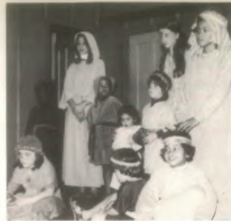
Longueuil youth depict scene where mothers and children came to see Jesus.