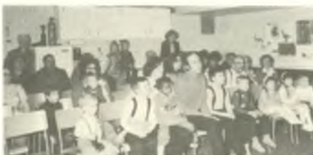
Many young children in Fort St. John assure the future of the church school.