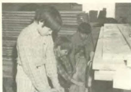
Fort St. John S.D.A. Church School boys making church pews.