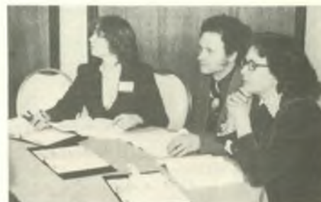
Thoughtful and eager describes students at the seminars such as the one in Hamilton.