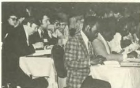
The people at the Toronto seminar are indicative of the interest shown in all seminars.