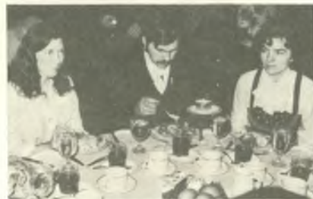
Good meals have been served by the hotels. Vegetarianism has been shown to be quite acceptable.