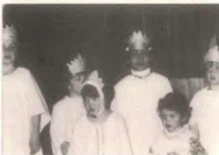
Special music was given by Cradle Roll/Kindergarten Sabbath schools.