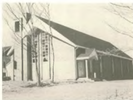
The new Dartmouth Seventh-day Adventist Church.