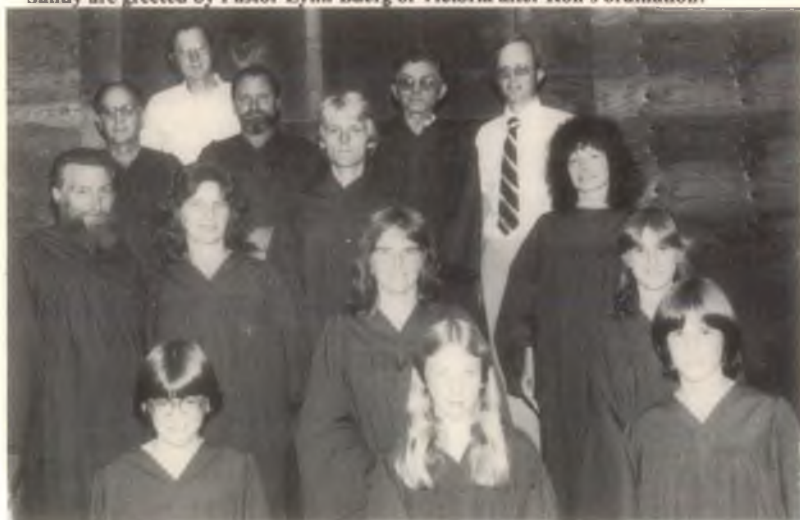
On the last Sabbath of camp meeting, eleven candidates testified of their faith through the rite of baptism.