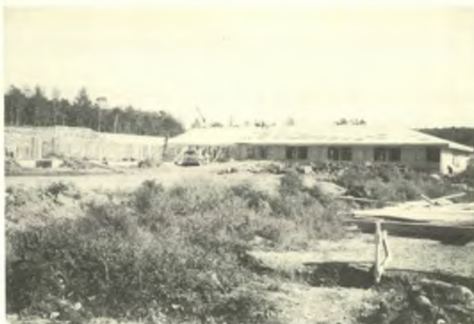
Rest Haven Memorial Nursing Home under construction in St. John, N.B.