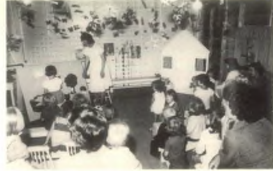
The children were well provided for as is evident in this Cradle Roll picture under the direction of Sylvia Atkins.