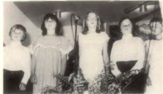
The Junior division is where the action is.