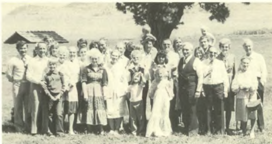
Company members, visiting friends, and Conference personnel pose for picture after the new Merritt Company formed in British Columbia on June 23, 1979.

34 Westminster youth participated in a weekend canoe trip up the Pitt River. Beautiful weather, singing around the campfire, a communion service and the grandeur of the natural surroundings all added up to make a glorious weekend.