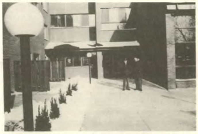
Two residents of Kingsway Pioneer Home in front of the main entrance.