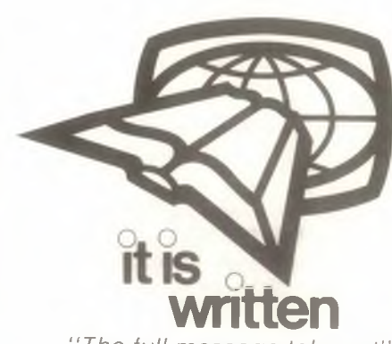
"The full message telecast"

The New Minas church sponsored a series of vegetarian cooking classes conducted by Muriel Lyons. Thirty-three attended and expressed appreciation for the devotional period preceding the lecture and slide program.