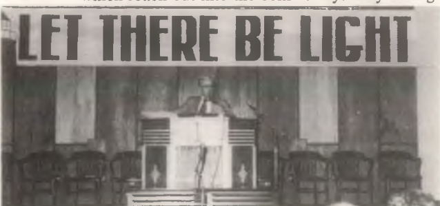
Watchword for the Seventh-day Adventist Church in Canada.

The Education Department is pleased to play a rewarding role in letting the light of the gospel shine forth from 83 "lighthouses" established from St. John's in the east, Terrace in the west, Windsor in the south, and Whitehorse in the north. Seventh-day Adventist schools are evangelistic centres where many decisions are made for Christ and for church membership. Many students and teachers are also active in witnessing activities which reach out into the community. May the light grow and not be dimmed.