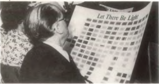
Studying ways in which various departments let their light shine.