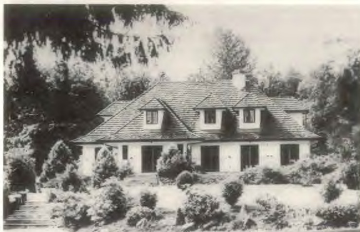
Radiant Living Evangelistic Centre for Metropolitan Vancouver.