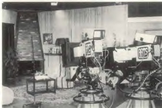
Set area of the Destiny telecast as it appeared on the day of the studio opening.