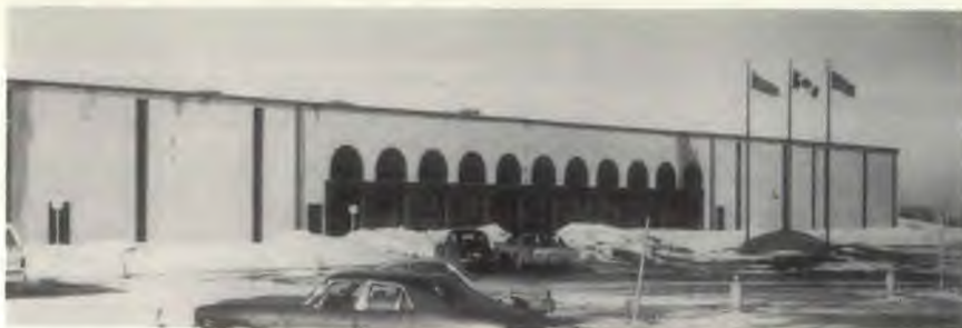
PARKLAND FURNITURE — Opened February 28, 1980