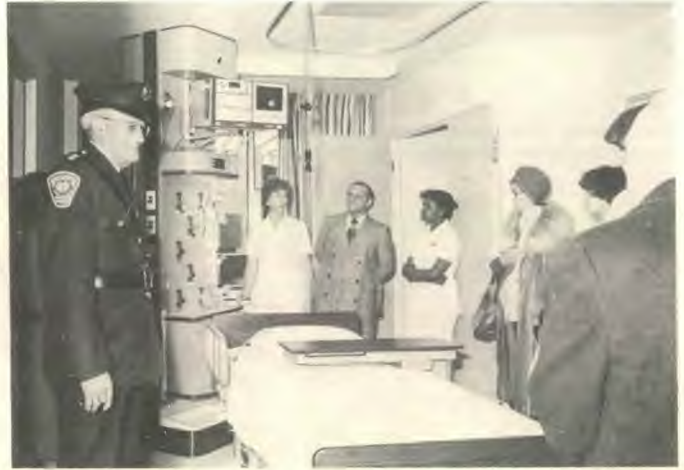
The “950 Power Column,” the “840 Bed” and some of the visitors on Open House day.