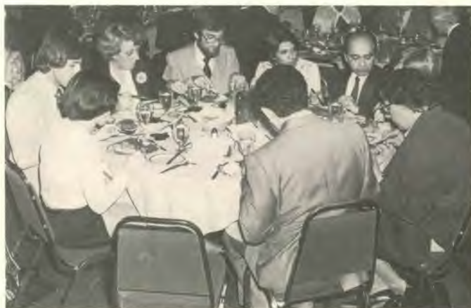
Conversation gives way to tasting the delicious full-course vegetarian meal catered by the fabulous Triumph Sheraton Hotel.

citing events many of our visitors expressed faith in the future of this