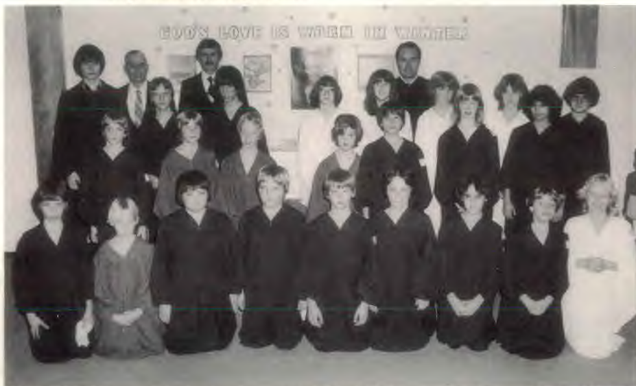
On January 26, twenty-four young people from the Lacombe Elementary School were baptized by Elders Corkum, Wigley and Campbell.