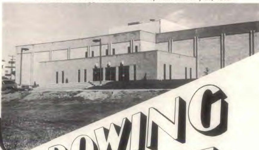
PHYSICAL FITNESS COMPLEX — Opened February 28, 1979