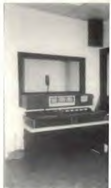
The audio control room mixers, a Scully 2 track recorder make up a fine

The new television ministry of Adventist Radio and Television Services is supported by contributions which are tax deductible. ARTS, 5000 Dufferin