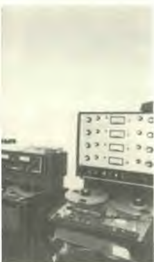
's booth. Broadcast Teac order and Scully mixdown ent package.