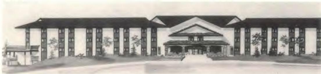
WOMEN'S RESIDENCE — to be ready August, 1980