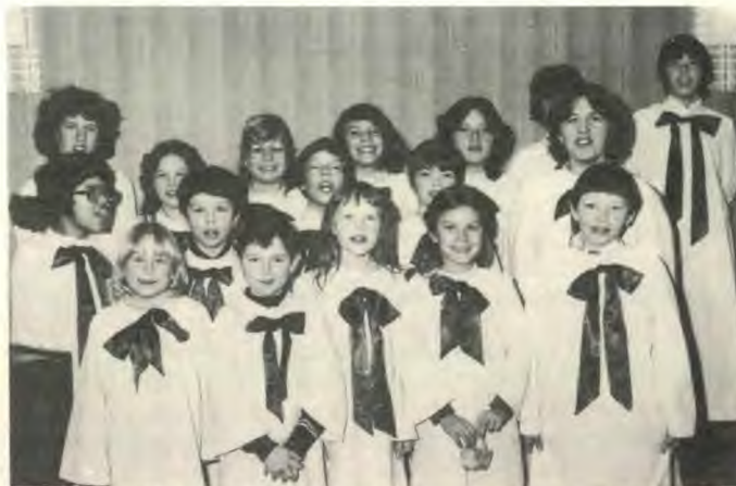
The Creston Junior Choir sings, "I'm So Glad That I'm a Part of the Family of God."