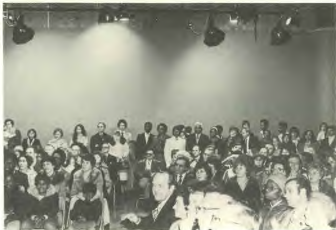
Eagerness shows in the faces of this cross section of visitors at the studio.