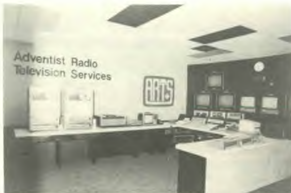
The spacious video control room. This hub of activity with its fine video editing equipment is in red, black and white decor.