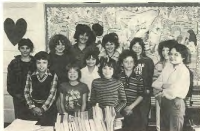
Golden S.D.A. Church School students.