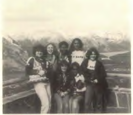
A group from the band enjoying the scenery on top of Sulphur Mtn. at Banff, Alberta.

thrill, especially picturesque Lake Louise. The luxurious hot springs at Banff and a gondola lift up a mountain were thoroughly enjoyed by the participants. Then back on the bus and off to Calgary where we played both sacred and secular pieces making our day a full one indeed.