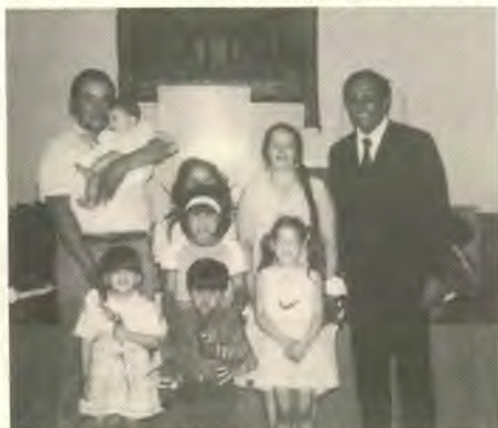
Children who were dedicated.