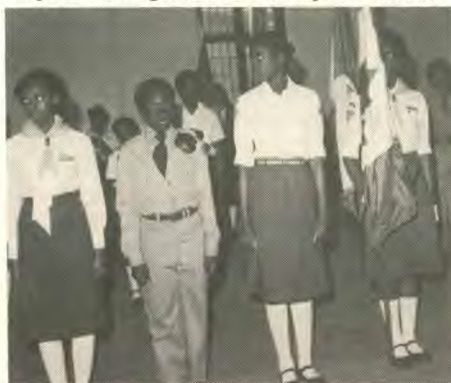
Parkdale Pathfinders conduct Sabbath services.