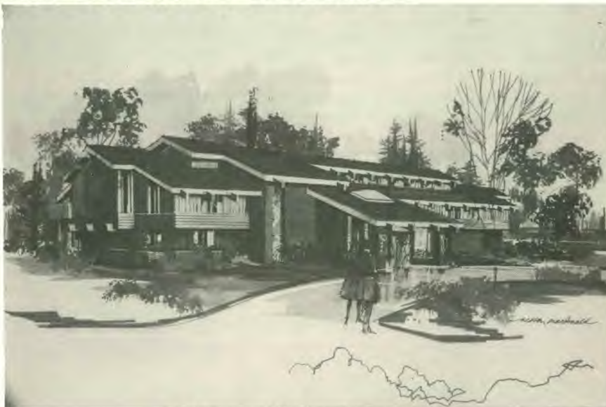
Artist's concept of Conference office building.