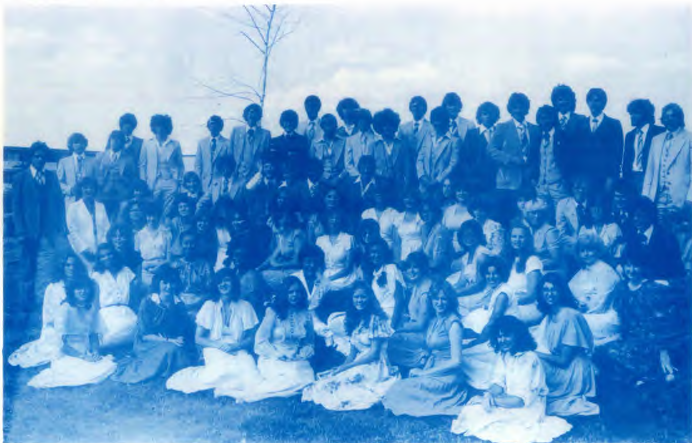
Canadian Union College High School Graduates who received diplomas in the June 22, 1980 commencement.