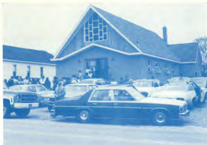
On dedication day every available parking space was taken and the church was filled from rostrum to front door. The "old church" is dwarfed by the new edifice.

A new, debt-free church building was opened and dedicated on May 31st in the presence of national, regional, and local officials of the church, members of the congregation, and a host of friends.