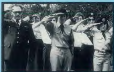
Stettler Club from Alberta