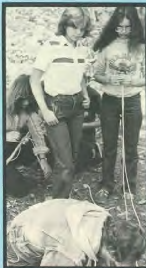
Lash that flag pole in record time