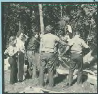
Hurry with those tents!