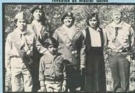
Mississauga Club members