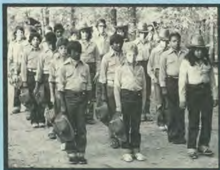
Red Deer Club of Alberta