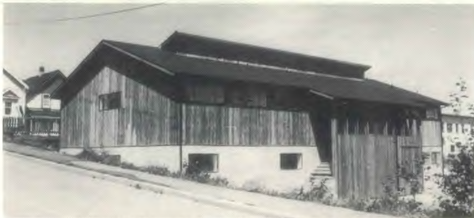
Prince Rupert Evangelistic and Medical Centre built by Maranatha.

June 16 the Maranatha volunteers arrived. A kitchen and eating tent were ready on site. The health department gave an unqualified approval of our eating facility and sent Victoria a fine recommendation for future Maranatha projects. Construction moved quickly - by the first Friday evening the shingles were on the 40 x 80 two-storey structure. The second Friday saw the building essentially completed. Some taping remained to be done in the dental offices on the second floor, the floor covering remained to be put on, a bit of painting and the light fixtures to be hung. The lower floor was ready for worship Friday evening - carpet, heating, and lights.