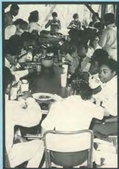
Even meal time is fun, eh! Winnipeg