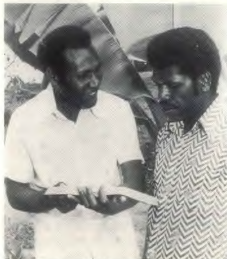
Sharing the Word. The keenly intelligent young people of the South Sea Islands are eagerly anticipating the possibility of attendance at the New Pacific Islands College.

With independence has come an increasing demand for greater self-reliance and for qualified local people who are able to give leadership in church and school and elsewhere.