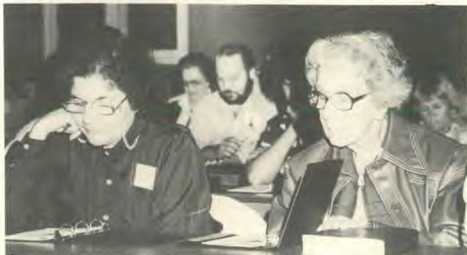
The Bible study classes using Bible and notebook were in the chapel at Ferndale.