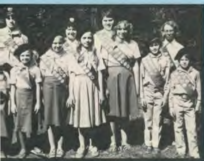
Alberta Beach Club