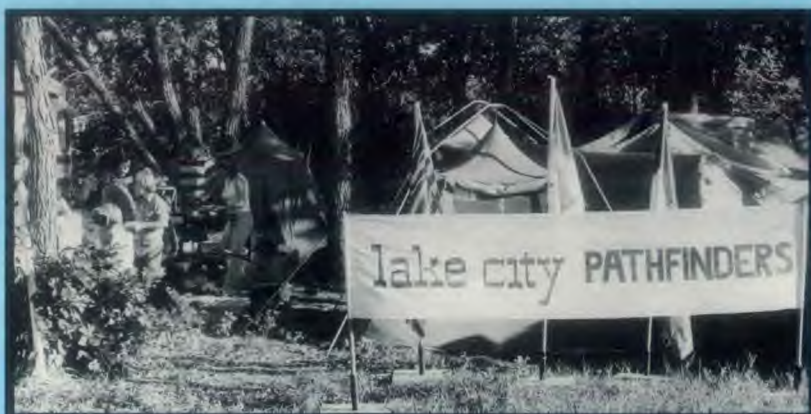
From Williams Lake, B.C.