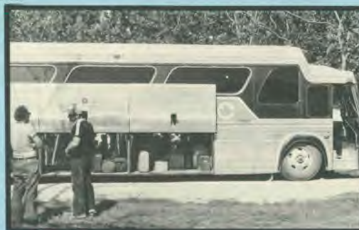
All aboard, next stop home.