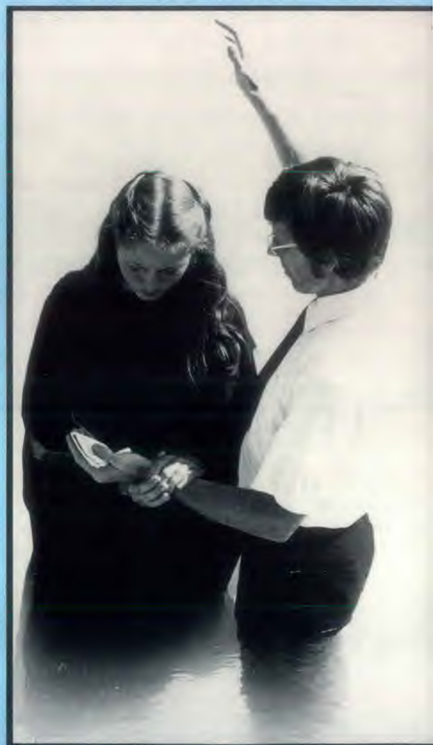
A Pathfinder during baptism Sabbath afternoon