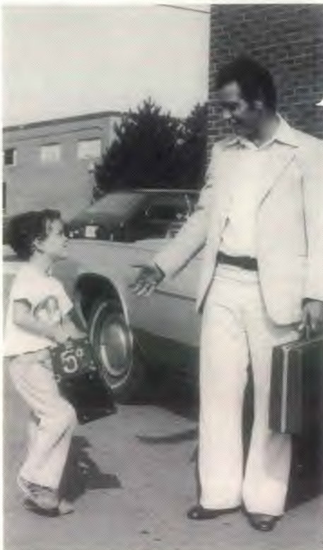
This young Spanish lad expertly carries out his role as a shoeshine boy in this sequence of a telecast entitled, "Because of Love!"