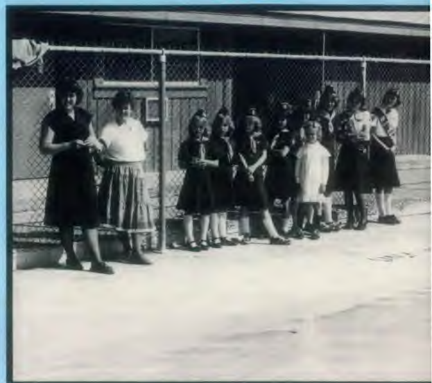
A baptism in the pool and a unit of girls from B.C. watching

"Thank you for the camporee, and please have another one real soon." This was the sentiment of several club directors and their Pathfinders as they started for home Sabbath night or early Sunday morning.