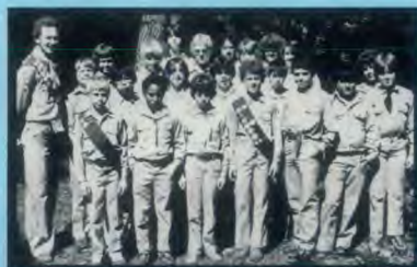
Edmonton Club from Alberta