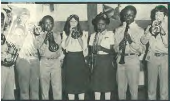
Special music from Winnipeg Club