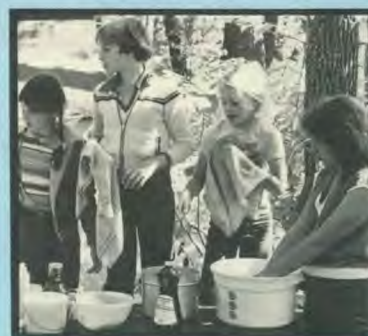
Meal time is cooking and cleaning