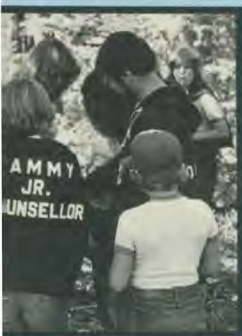
Junior Counsellor helps!