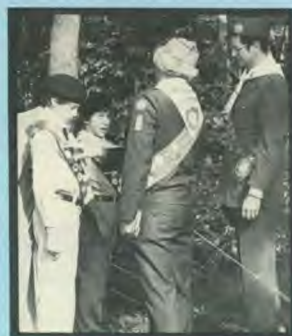
Inspection one unit of Foothills Club from Calgary, Alberta