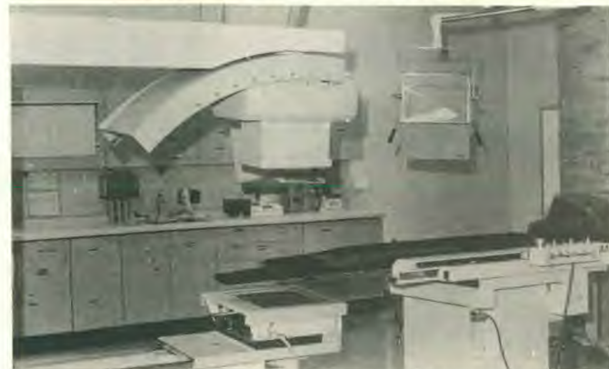
U.P.I. unit for special procedures such as angiography.