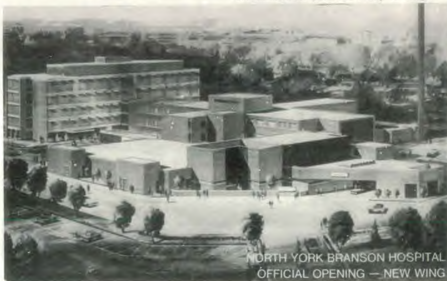
NORTH YORK BRANSON HOSPITAL OFFICIAL OPENING — NEW WING

Even institutions develop character—the legacy of the leaders and the people who have coached, nurtured and molded it. The recent opening of Branson Hospital's New Wing proves that Emerson was right when he said, "The human will, that force unseen, the offspring of a deathless soul, can hew a way to any goal though walls of granite intervene. Be not impatient in delay, but wait as one who understands, when spirit rises and commands the gods are ready to obey."