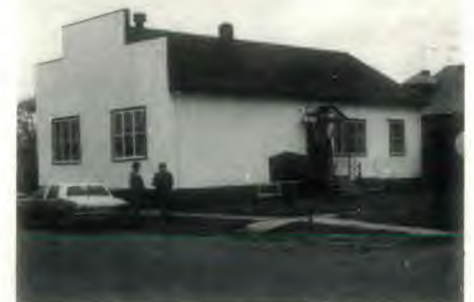
The church that used to be a butcher shop - 922 1st St. N.W., Dauphin, Manitoba.