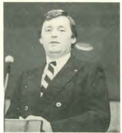
Dennis Timbrell, Minister of Health