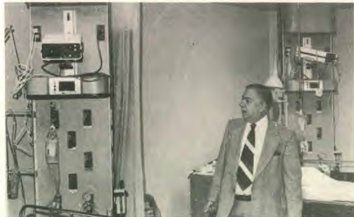
The 950 Power Column — first of its kind in Canada.