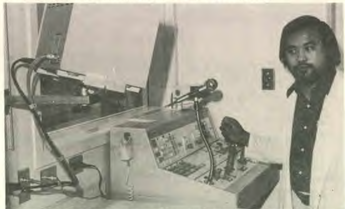
Fiel Poblete demonstrates latest in Radiology techniques.