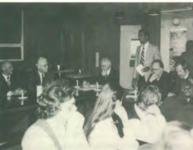
Elder Bacchus thanks the workers for their part in surpassing the Ingathering objective.