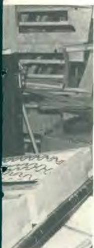
tion major from velops speed and CUC's furniture