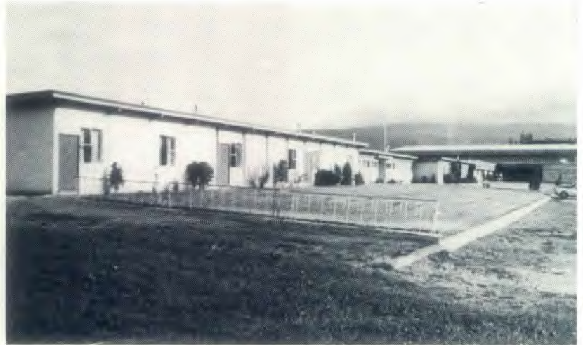
Okanagan Adventist Academy