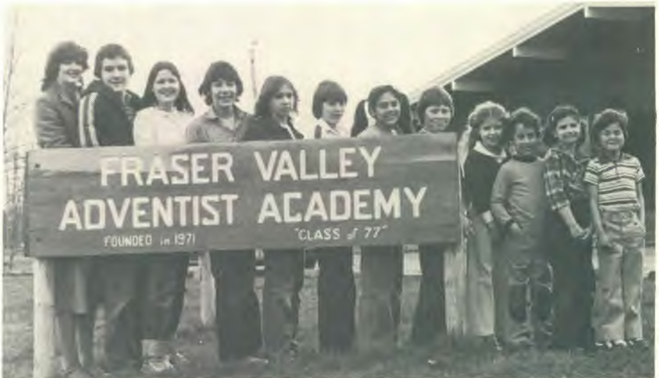
In front of the academy are students from each of the twelve grades taught at Fraser Valley Adventist Academy.

"Character building is the most important work ever entrusted to human beings." Ed. 225