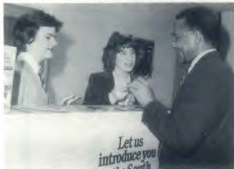
A parent welcomed to an around-the-world musical trip.

Upon arrival at the auditorium, visitors were handed their tickets (the evening's program) by student "airline hostesses." The choir and singing groups were costumed to represent the various countries visited during the around-the-world musical tour.