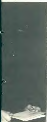
returns to CUC for foma.