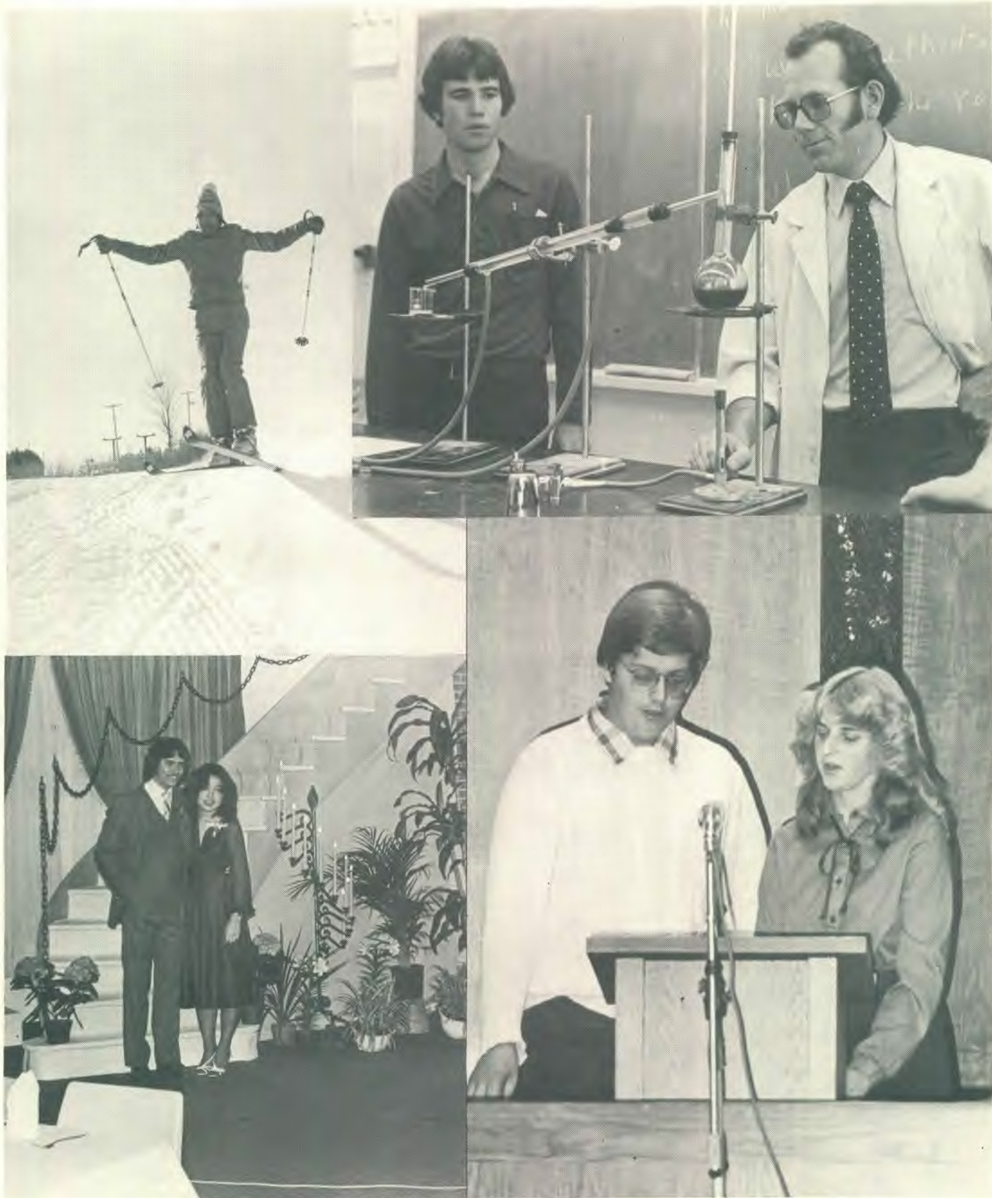
The four sides of education at Kingsway — on the ski slopes, in the lab, at supper club and in the chapel.

"True Education' is that which will train children and youth for the life that is now, and in reference to that which is to come; for an inheritance in that better country, even in an heavenly." FE 328