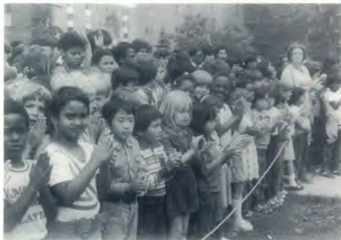
Appreciative students attending ground-breaking ceremonies.