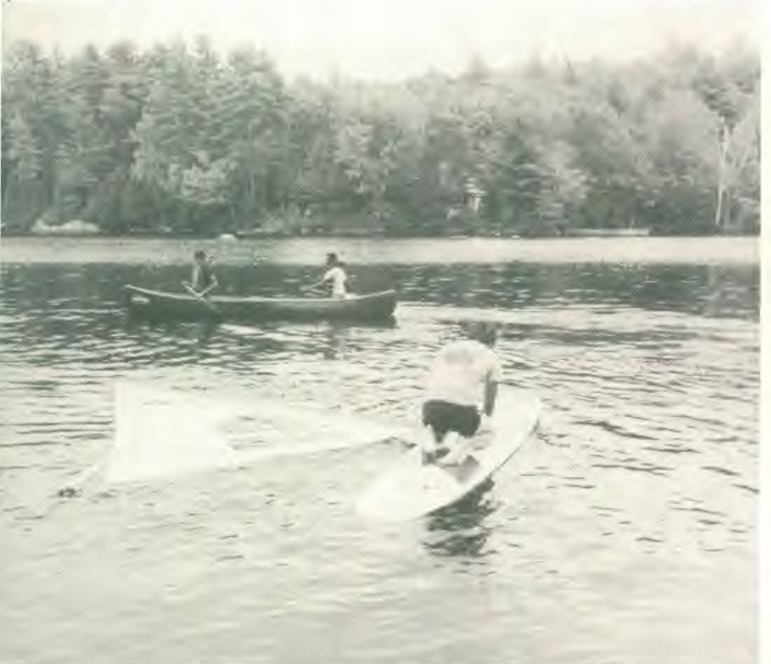
Rosseau was just right for canoeing and wind surfing.