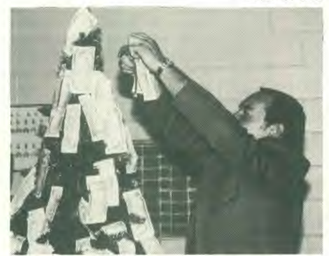
Money tree was presented to the Sparenberg family as a farewell gift from the church family.