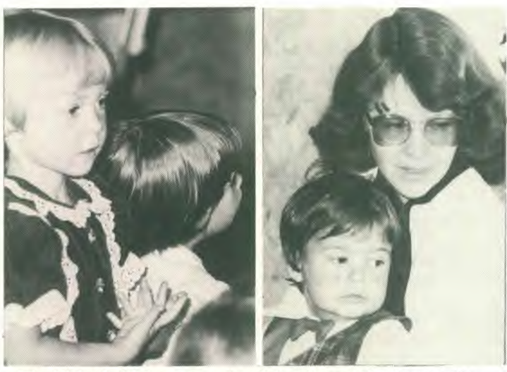
The children's divisions were well staffed, well attended and very active.