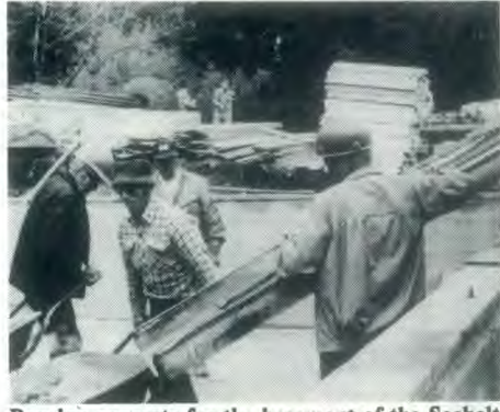
Pouring concrete for the basement of the Sechelt Church and Better Living Centre, Sechelt B.C.