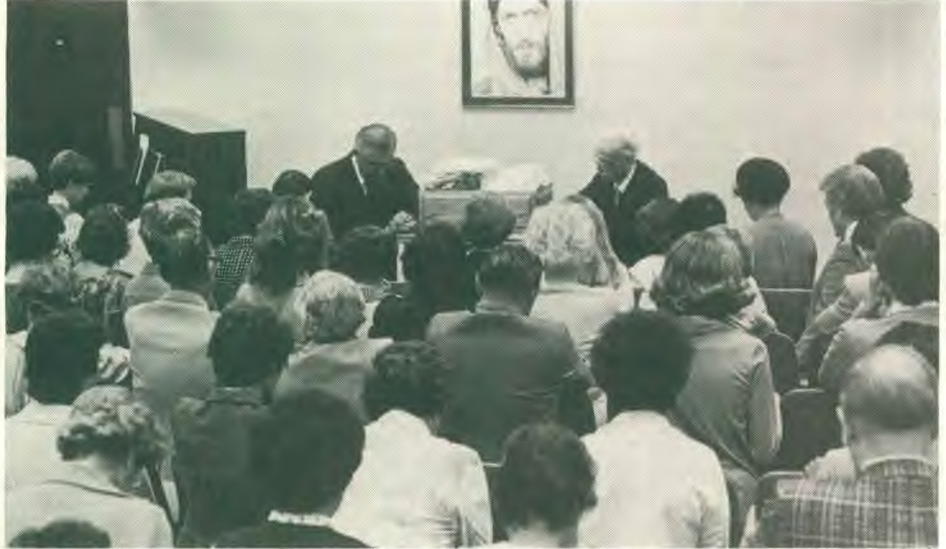
Every Thursday morning, the Voice of Prophecy staff gathers to read prayer requests sent from all parts of North America. God's answers to the intercessory prayers offered have been a strong witness to those who