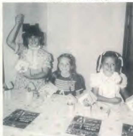
Three primary girls display crafts they made at Dartmouth V.B.S. Approximately 35 attended for the five-day school, reports Trudi Charles.