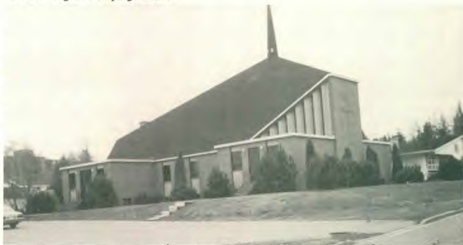
The newly purchased Fredericton S.D.A. Church