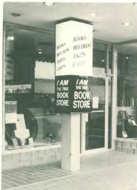
Book store at Vernon, B.C.