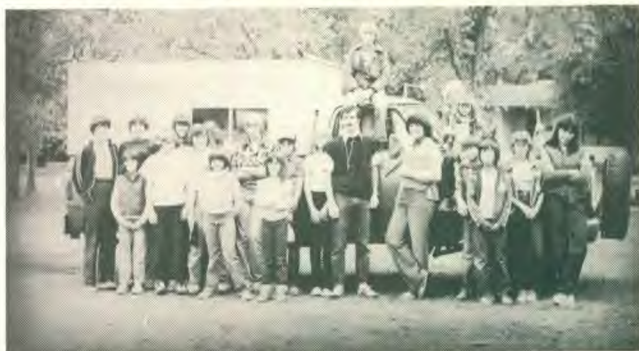
Some of the Bridge City Pathfinders about to leave on fall camp out.