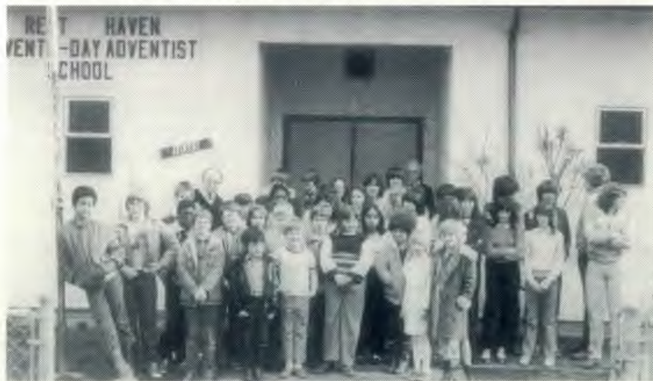
Rest Haven SDA School

When parents were asked about the advantages and disadvantages of a church school education, the advantages far outweighed the disadvantages. A Christian education costs money, that is an absolute