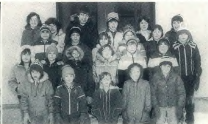
Students of the Rosthern, Saskatchewan Seventh-day Adventist school. Students participate in a school band, a school choir, and are active in prayer meetings and other church activities.