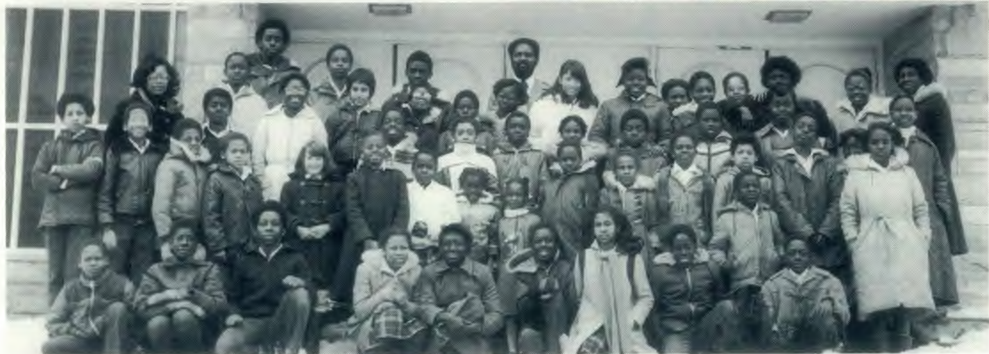
Toronto Kingsview Village Seventh-day Adventist School