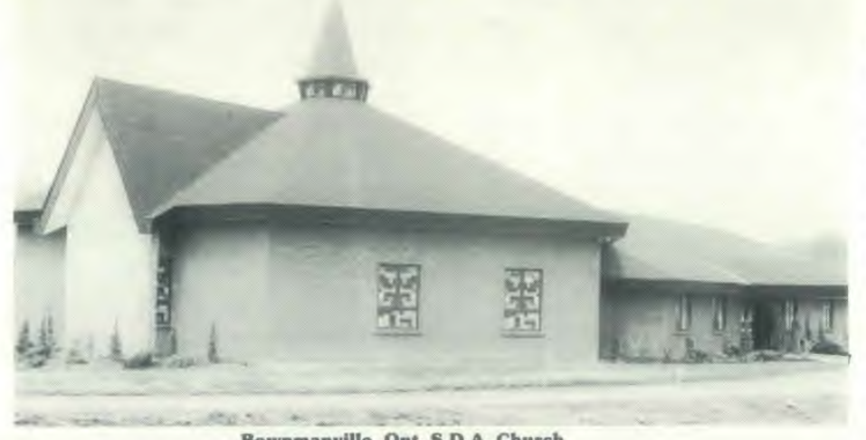
Bownmanville, Ont. S.D.A. Church

When we pray for Pentecostal power to finish the work in the world, let us never forget to pray for Pentecostal grace that it may be finished first in our own homes.