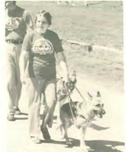
Seeing-eye dogs guide blind campers at Camp New Frenda, Port Carling, Ont.

So we thank you for believing in the work begun 83 years ago and helping the blind eyes to see.