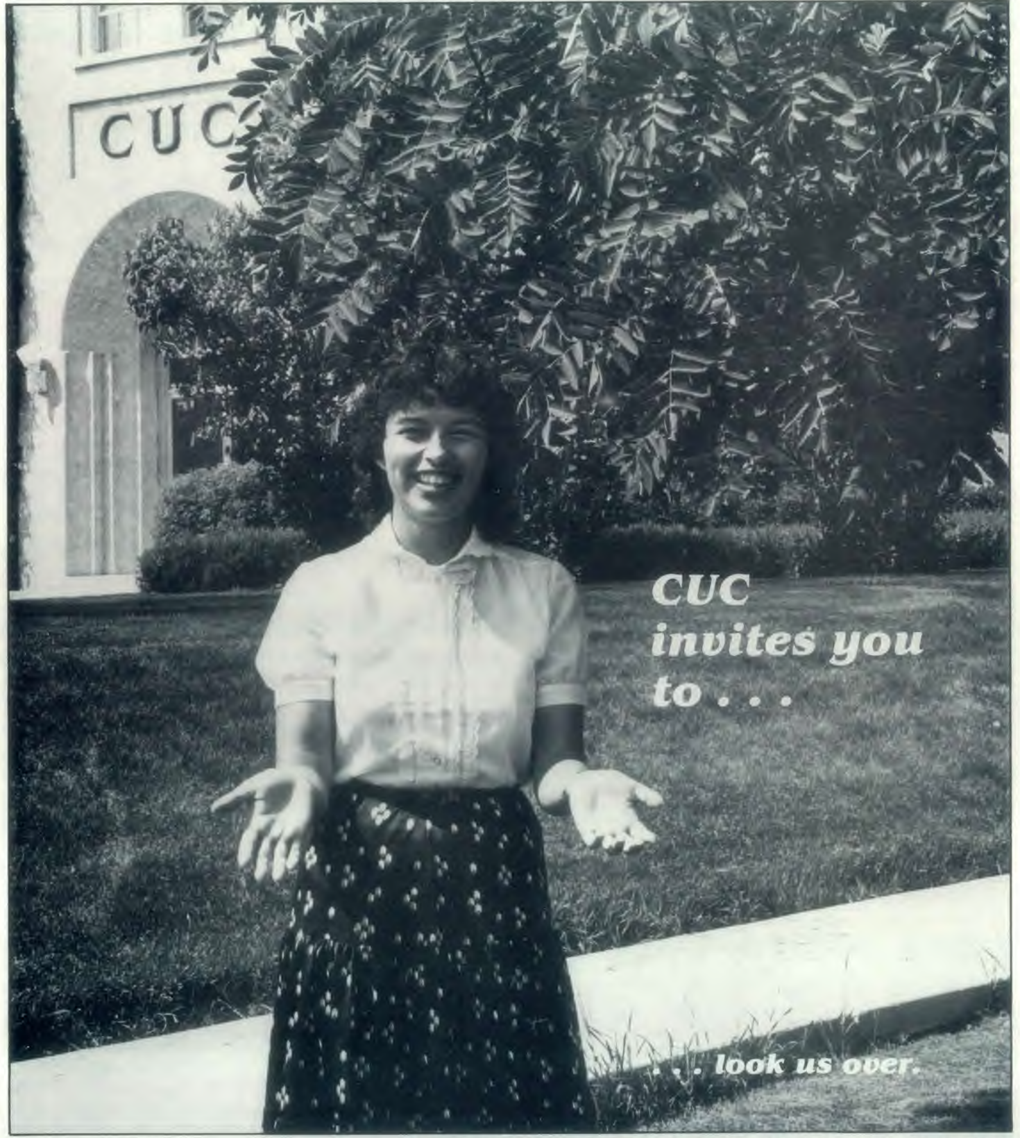
For further information write: The Registrar, Canadian Union College, College Heights, Alberta TOC 0Z0