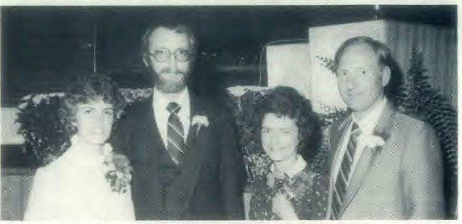
Trenchards and Cottons at their ordination service.