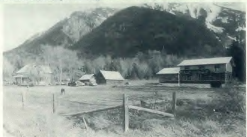
Buildings from left to right: Boys's Dorm, Woodshed, Root Cellar, unfinished Girls' dorm (the girls stay in a rented house until the new building is completed).

In September, 1982, a new boarding school will open in British Columbia – Bella Coola Adventist Academy. Grades 9 and 10 students from various locations will be treated to a fresh and exciting approach to education.