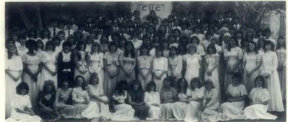
One hundred and nineteen students graduate from the high school division of Canadian Union College.

One hundred nineteen seniors graduated from the high school division of Canadian Union College on June 20, 1982. The entire weekend was filled with commencement activities. For example, "Class Night" on Friday evening highlighted interesting, humorous events from the life of each senior.