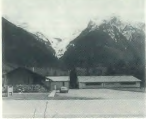
The main classroom building for the academy is on the right. The church is on the left.