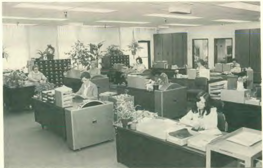
Every student in the Voice of Prophecy Bible School has the same instructor throughout an entire course. More than 2,000 test sheets are graded every day by the school's 10 instructors. The Bible School, which is celebrating its 40th anniversary this year, has graduated over three quarters of a million students since its founding in 1942.