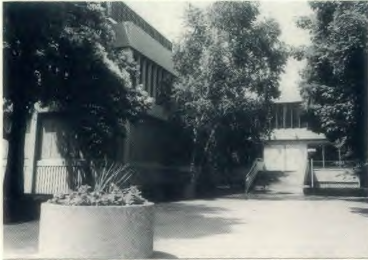
Ivor Wynne Centre, where the Adult Meetings were conducted.

May camp meeting continue to be a time of blessing and commitment that will further prepare us for the greatest convocation ever held, after the coming of Jesus.