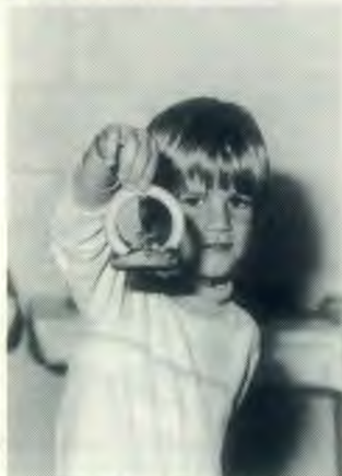
Proud of his craft, this little lad holds it out for all to see.