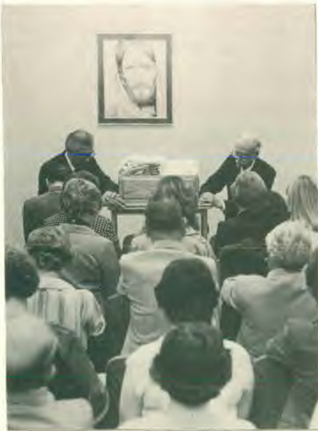
Prayer is a very important part of every day for a faith ministry like the Voice of Prophecy. Thursdays are particularly special because at 8 a.m. staff members hold the Worldwide Prayer Circle to pray for the hundreds of people who send in prayer requests every week. Similar services are held by more than 100 overseas VOP offices.