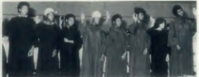
A highlight of camp meeting is a baptism. Soul winning was one of the central themes at camp meeting.