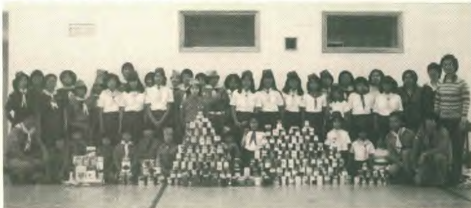
Filipino Pathfinders of Toronto and their food collected through "Treat-No Trick" Halloween campaign.

This project was a first for the group. It was so greatly enjoyed by all who participated that the Pathfinders are already planning to cover an even larger area next year.