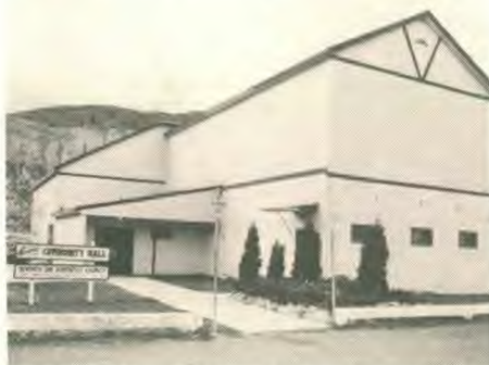
New location and facility for Ashcroft SDA Church services.

After renting the local United Church for several years, local Adventists have moved to new rented facilities in the recently renovated and vacant Ashcroft Community Hall. Quite adequate facilities are now available for the church to use all week long without the bother of constantly moving various Sabbath School and church supplies in and out for Sabbaths. Now everything is permanently set up as members have full use of the rented portion of the building as if it were their own church. Even an attractive sign identifies the church and its services, and is well located on a permanent basis. Members rejoice in these improved facilities and cordially invite visitors to worship with them. Members of the Ashcroft Company look forward with great optimism to baptisms and church growth.