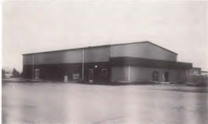
College Heights Adventist Junior Academy Auditorium.