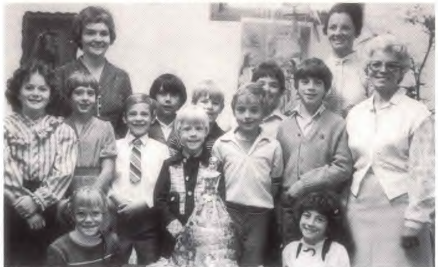
The primary children and teachers of the Sherwood Park Church dressed a doll entirely in currency from pennies to $10 bills. Over $500 was raised for the Investment Fund.