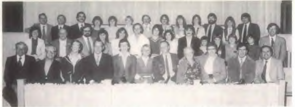
A total of 57 people were baptized following the Wadie Farag Crusade in Kelowna. Pictured here is a portion of that group.

The churches in the Kelowna area united in support of an evangelistic crusade in the Community Theatre in downtown Kelowna conducted by Conference evangelist, Wadie Farag. The 800 seat theatre was filled at the opening meeting and the attendance remained good throughout the six week crusade, and 57 people were baptized by the area pastors.