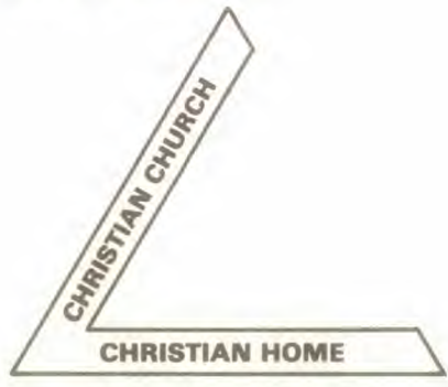
(Better - but still incomplete)

The church adds to the teaching started in the home. In the church, motivational factors, intellectual decisions, and spiritual enlightenment are refined and elevated.