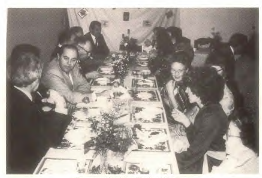
Banquet at Maritime Workers' Meeting.