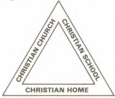
(Complete - Solid, Sound, Secure)

The Christian school provides academic preparation, formal instruction in God's Word, opportunities to share life's values, to make decisions, to practice a Christian lifestyle, to set goals and attain them, and to gain skills in the social graces.