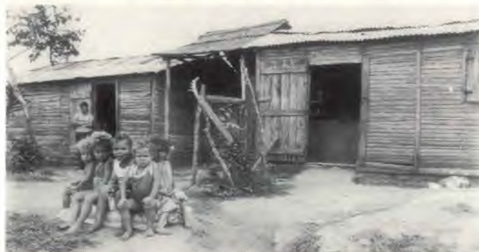
The building to the right is a typical store in the Dominican Republic. It is situated across the road from ICC (International Children's Care) orphanage and sells soda drinks, toiletry items and a small variety of food stuffs. The store owner's residence is the left section of the building. He and his wife live there with their sixteen children, some of whom are sitting in front.