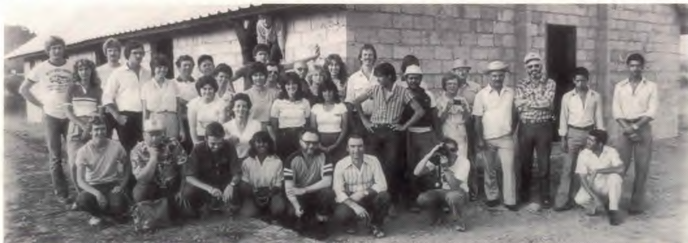
New church at Sonador, Dominican Republic was constructed in seven days by the group pictured. It is on property donated by the ICC orphanage and will serve both the orphanage and community. Just one and one half kilometers away is Collegio Adventista, and the surrounding area is a beautiful valley of rice paddies, pineapple, tobacco fields, citrus groves and nickel mining near Bonao. The thirty-two builders rejoice to have a part in starting some new work in the Dominican Republic.