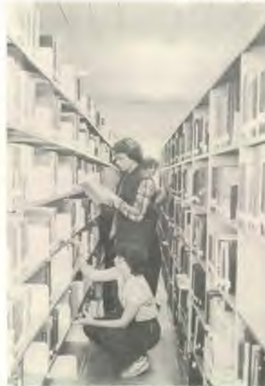
Students search between crowded bookshelves in C.U.C. Library.

The rapid growth of the Education Department: graduating Education majors numbered 3 in 1981, 13 in 1982, 22 in 1983. The Education Department is presently housed in the lower Library; however, the Library is also in desperate need of the space for continued growth to meet the demands and interests of a growing college population. Due to crowded book shelving load factors are presently being exceeded and must be corrected.