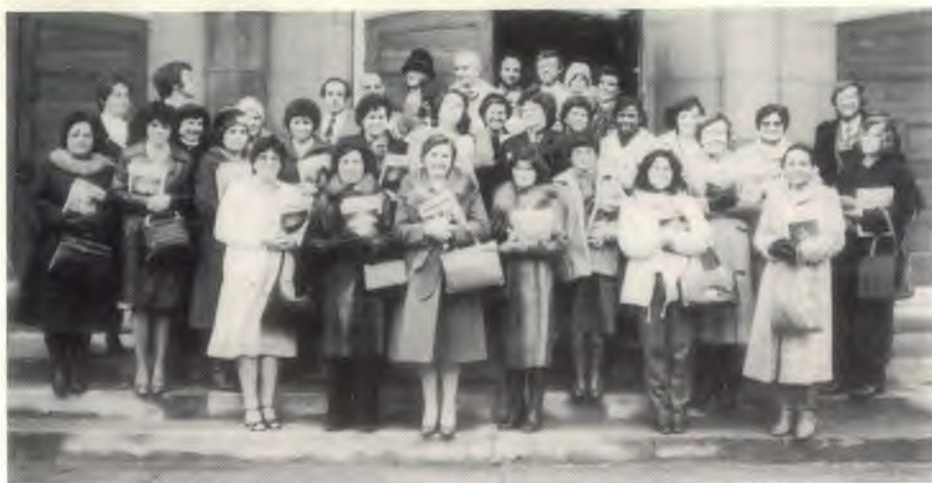
Active missionary group leaving church for door-to-door distribution.

1983 is a year in which we expect to have great results in a major plan of action that has been launched to evangelize the Portuguese community.