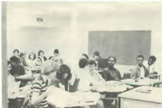
Present Education classroom designed for 24 students holds classes with more than 40 students.

By volunteer labor: students' work bees are scheduled for the end of March and the beginning of May. These are designed to prepare the building for the mechanical work. A final work bee is scheduled for June 22 to July 5. This will complete the building for Education use. We are counting on you.