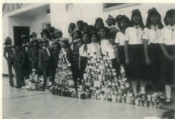
After their treat-no-trick campaign.