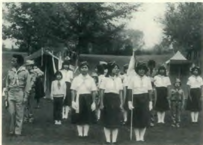
Inspection at Camporee.