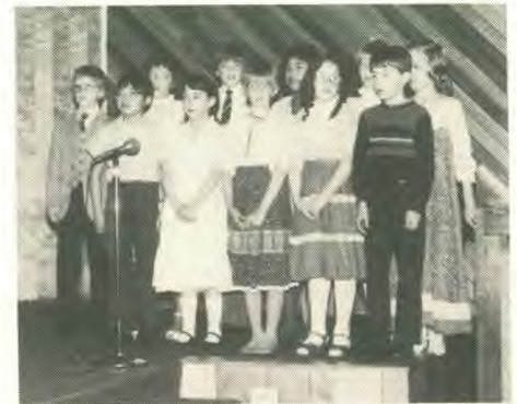
The Grades 3 and 4 class presented part of the Scripture lesson for church.