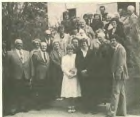
Friends and fellow church members meet in Leader for Adventist services.

Everyone was excited when the Evangelical Church was made available at a very reasonable price so that the group could meet for their worship in a real church building.