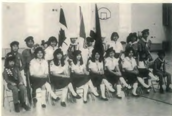
Officers of the Orion Club.