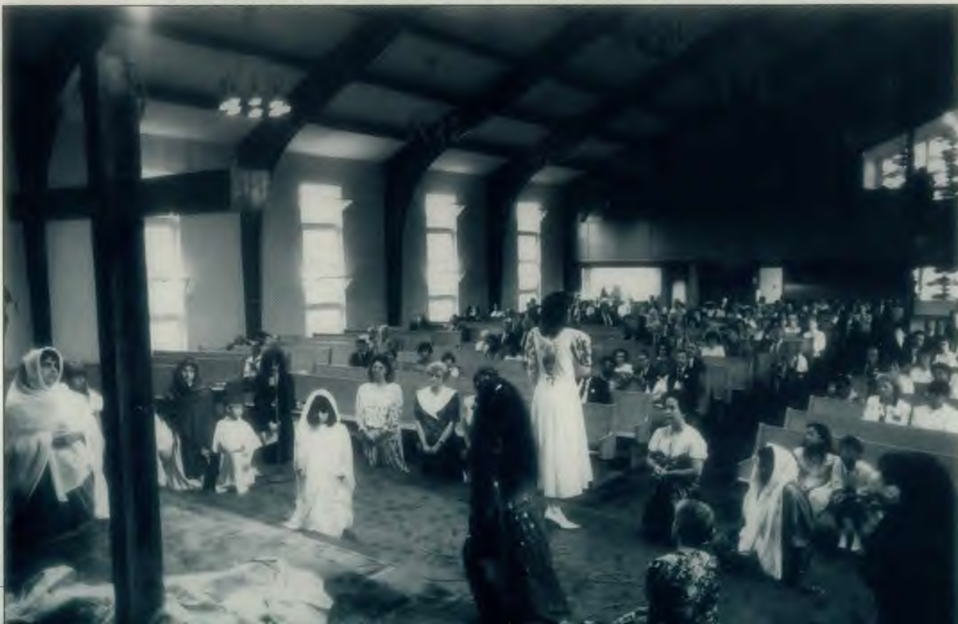
Sabbath Evening Vespers: "The Women at Calvary", a play presented by Women's Ministries.

We are all aware of Global Mission and the emphasis that is being placed on this important world program.