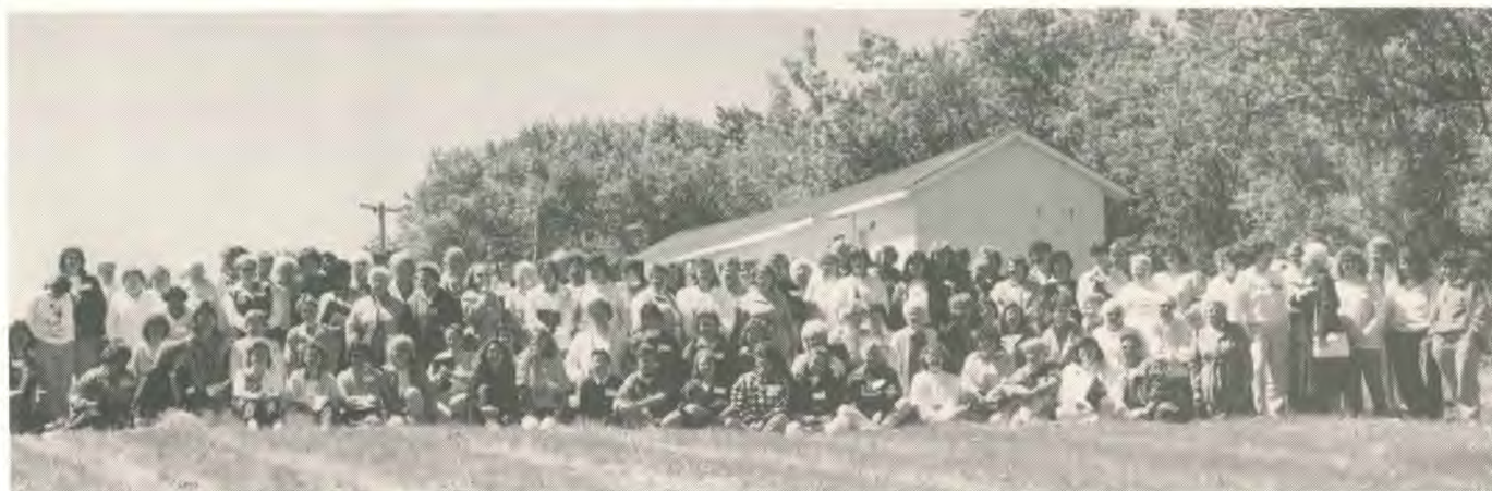
The group at the Women's Retreat at Camp Pugwash.

One hundred and fifty women attended the first Women's Retreat for the Maritime Conference held at Pugwash on June 7-9.