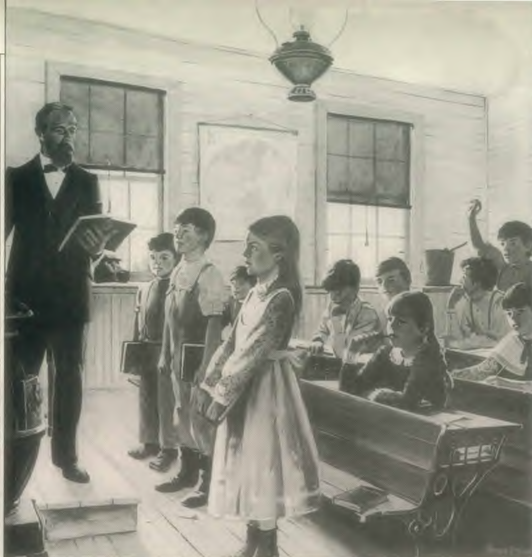
Typical early Adventist church school classroom.