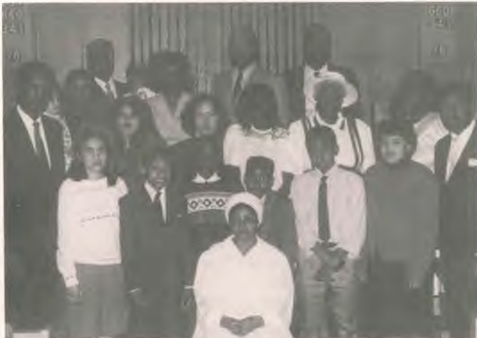
Part of the group of 22 who were baptized at the conclusion of the Bethel crusade.