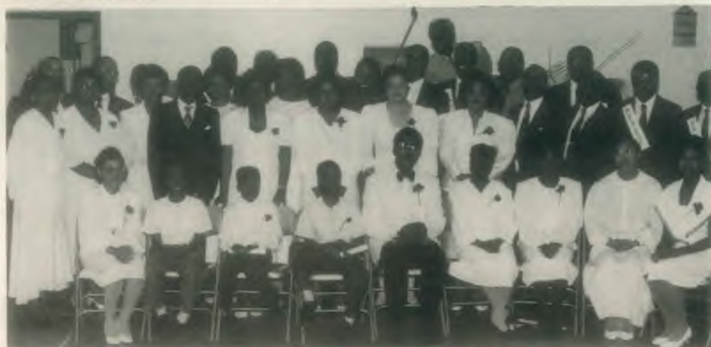
Graduates of the Revelation Seminar in Malton.

On May 4, the Revelation Seminar culminated with a class graduation of thirty. Since that time, Malton church members have been rejoicing with three of the Revelation seminar graduates who decided to confirm their commitment to Jesus through baptism.