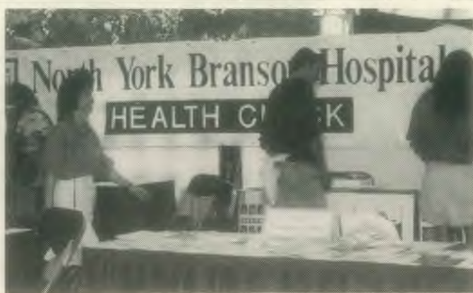
This was the third annual Health Check organized by the community relations and health promotion departments.