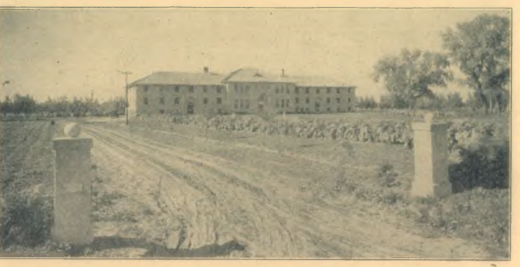
SHELTON ACADEMY, SHELTON, NEBRASKA

With our industrial equipment, we are prepared to compete with any school outside of tax supported institutions, in the