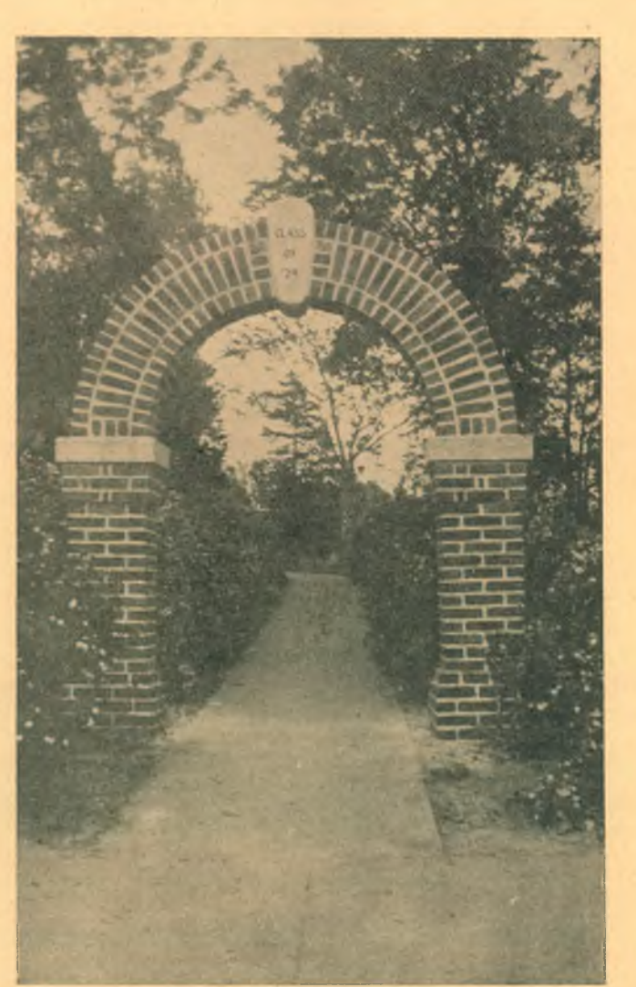
THE GATEWAY TO OPPORTUNITY

"The Lord desires us to obtain all the education possible, with the object in view of imparting our knowledge to others."— Christ's Object Lessons, page 333.