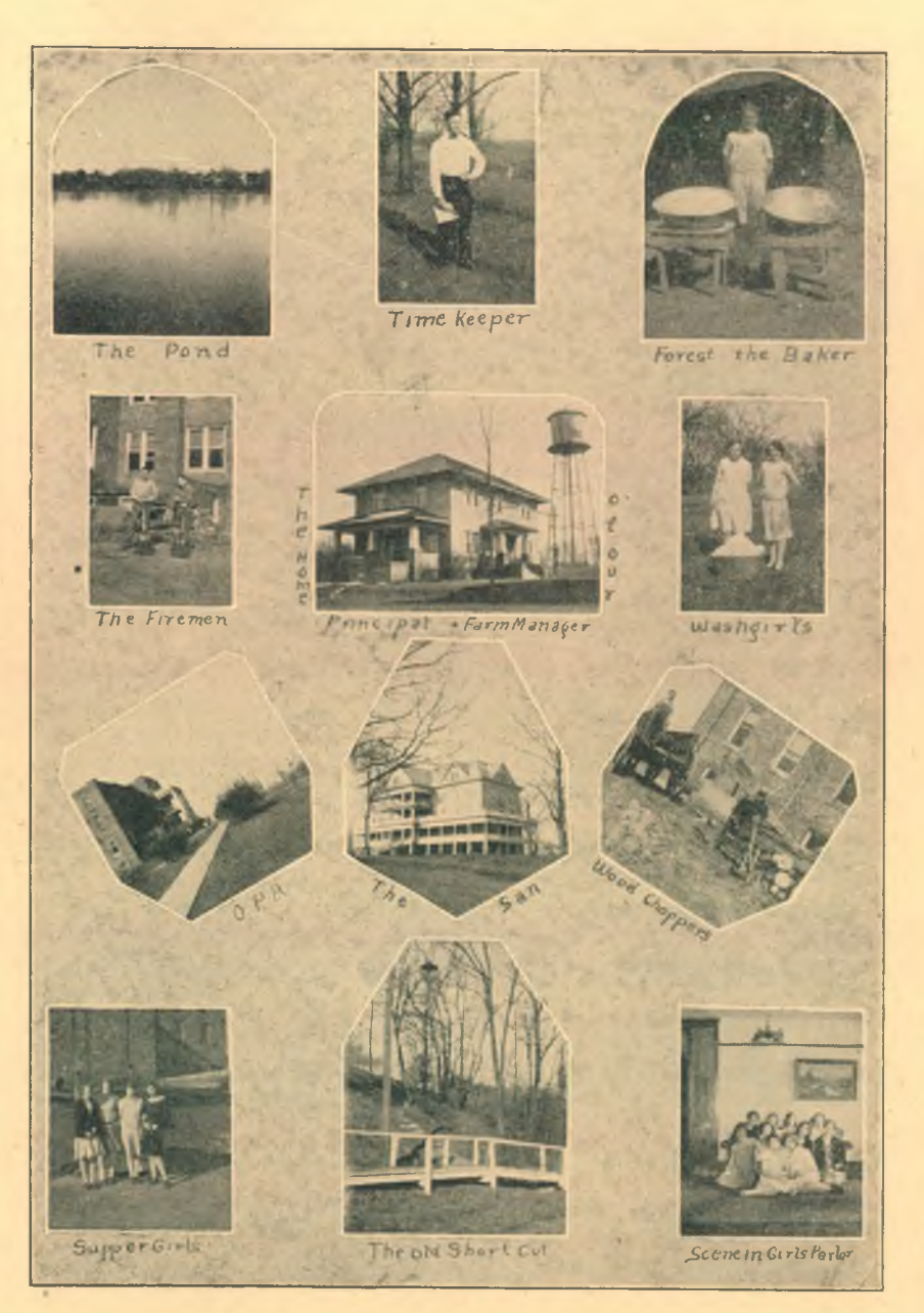
Scenes from Oak Park