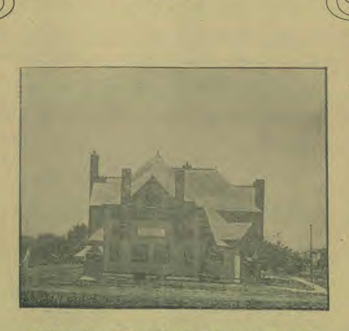
College View Seventh-day Adventist Church