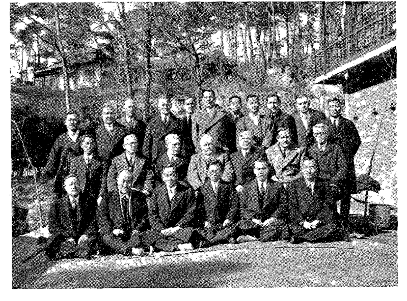
Group of Ordained Ministers in Attendance of the Chosen Union Meeting, Seoul, Korea

A Ministerial Institute was held in connection with each union