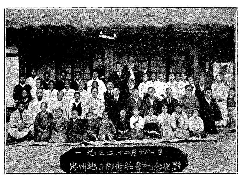
Delegates from eight Sabbath Schools who met at Choong Choo for a Bible Institute

In order to increase the Sabbath school membership there must be very (Continued on page 7)