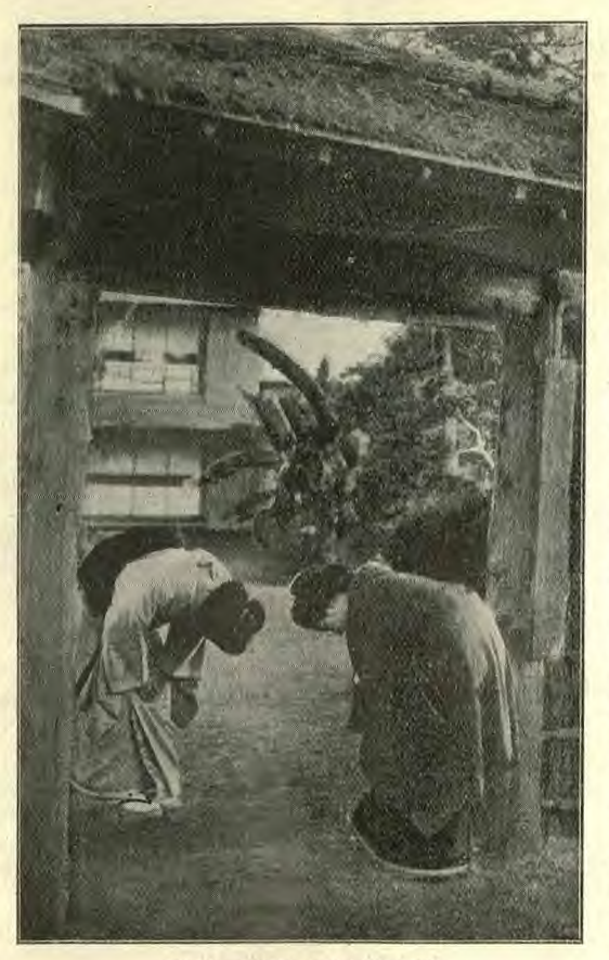
AN OUTDOOR SALUTATION.

Never before had I felt so big and awkward and altogether cumbrous as when ushered into this minute and dainty home. Together we seemed to shake the house, as we passed from room to room through the pretty sliding panels for doors. I tremble to think of the breaches of etiquette we were committing by the score; for no well-mannered guest in a Japanese house arrives at the seat of honour, his appointed place, until repeated humble manœuvres have been made, seating