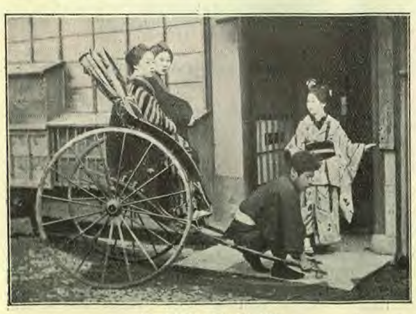
ARRIVING AT AN INN.

foot deep, but more often a round, deep metal vase, quaintly embossed. This is nearly filled with dead ash, upon the top of which are piled up six or eight sticks of glowing red-hot charcoal. A pair of metal sticks are stuck into the ash with which to stir the charcoal as it deadens. Leaving us with hands extended over this very welcome warmth, our hostess again retired, returning this time bearing the inevitable tea. Nothing can happen in Japan without first drinking tea; so if readers of GOOD HEALTH will bear with me for a minute