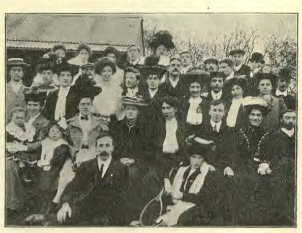
A FEW HEALTH ENTHUSIASTS.*

It is very difficult to obtain butter milk in our large towns and cities, and even when it can be obtained, it is quite unpalatable, owing to the methods generally