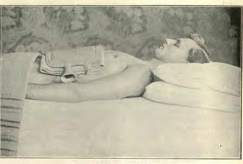
FOMENTATION TO THE STOMACH.

Medicines may be left out of account in treating dyspepsia on rational lines. In some special cases, to be determined only by a qualified medical man, they may prove of some temporary use as palliatives,