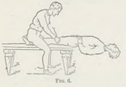
Fig. 6. In this movement the position is reversed, the legs being supported and held in position upon a platform by an attendant, while the trunk is sustained in the

air by the muscles of the abdomen and thighs. This movement should be used cautiously at first by those who are unaccustomed to such exercise.