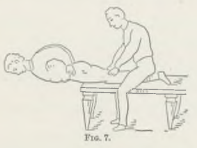
Fig. 7. This is a modification of the preceding, in which the trunk is sustained with the face downward. In this move-

ment the principal strain is upon the muscles of the back instead of the abdomen.