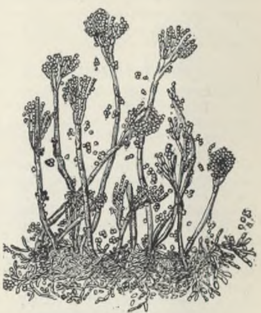
Fig. 3. Green Mold of Old Cheese and Stale Bread, (Hassall.)

Fig. 3 is a representation of the green mold so often seen on old cheese, stale bread, and other articles of food, as seen under a good microscope. It is by no means a harmless fungus, as the most